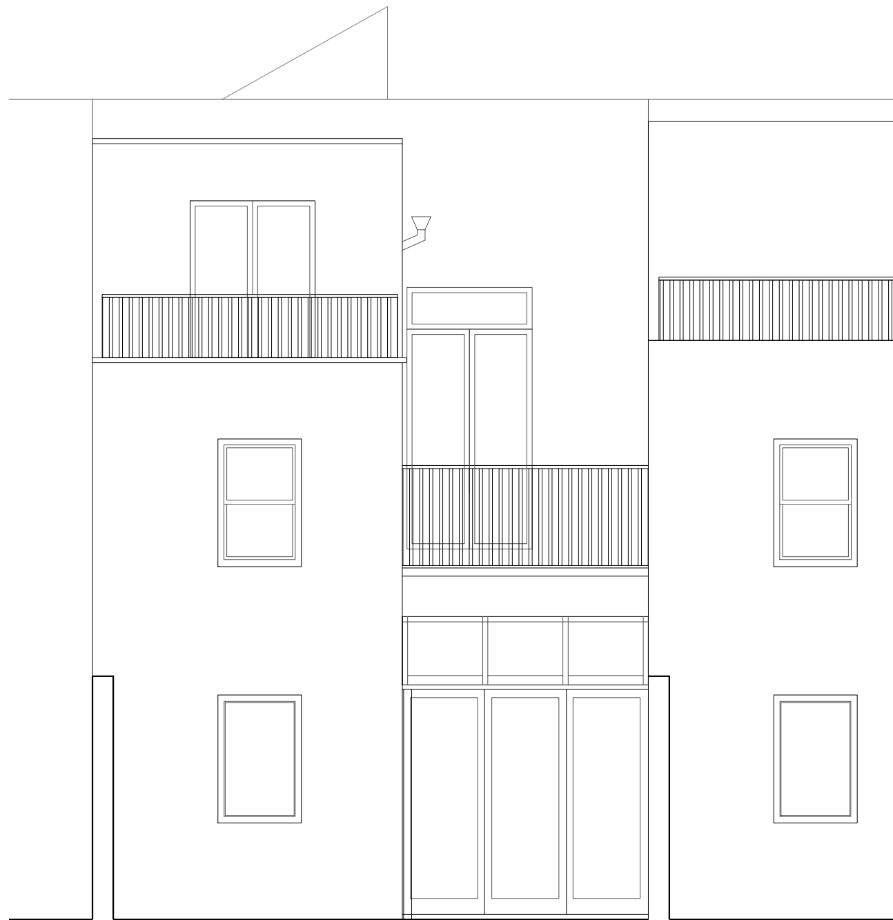
1 Existing Rear Elevation Scale 1:50 at A3