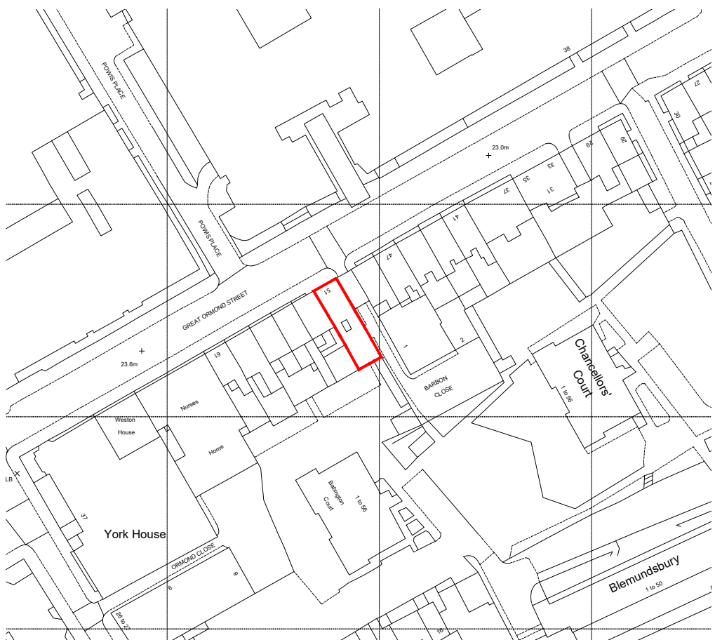
LOCATION PLAN - 1:1250