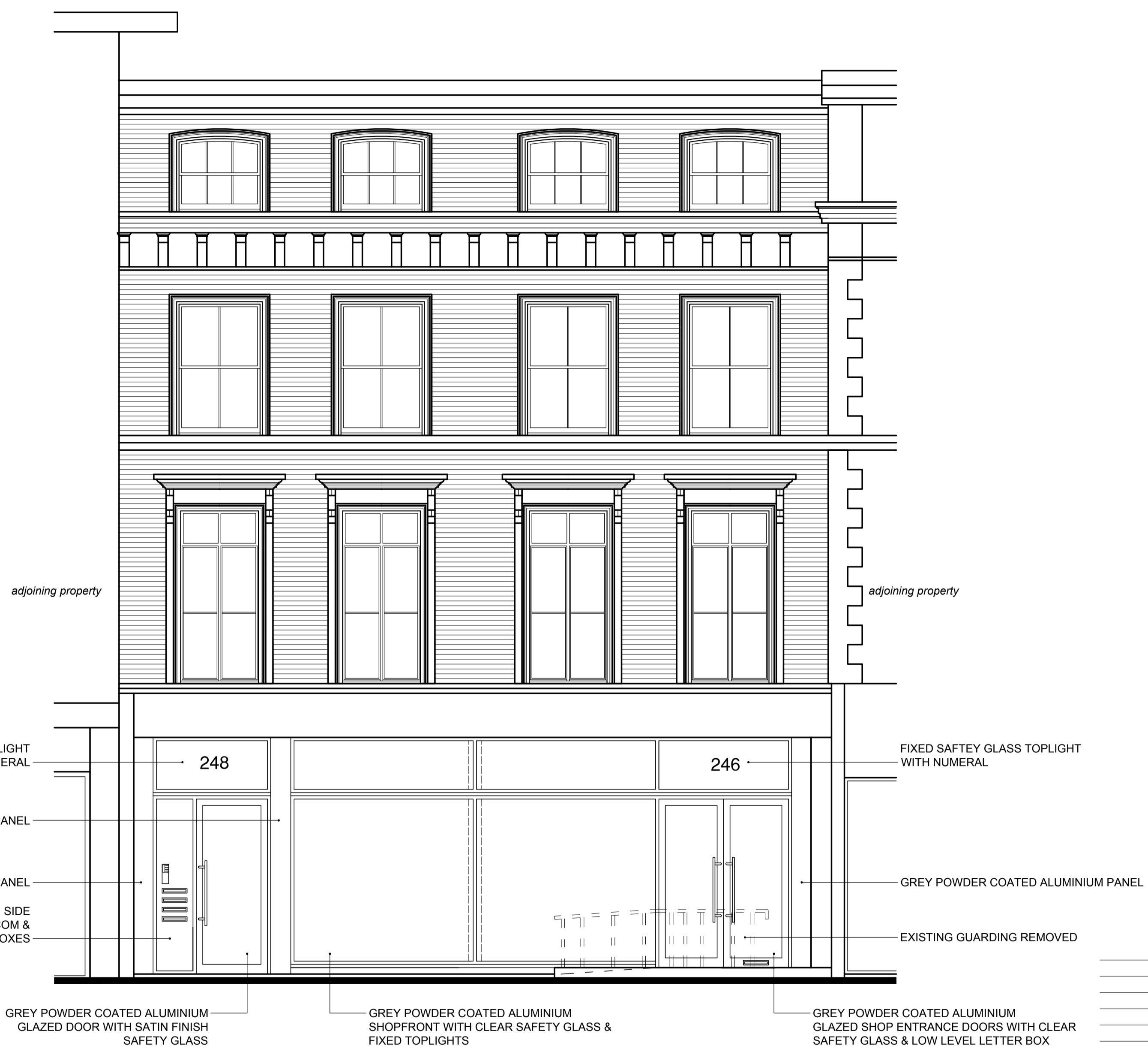
PROPOSED STREET ELEVATION - 246-248 KENTISH TOWN ROAD