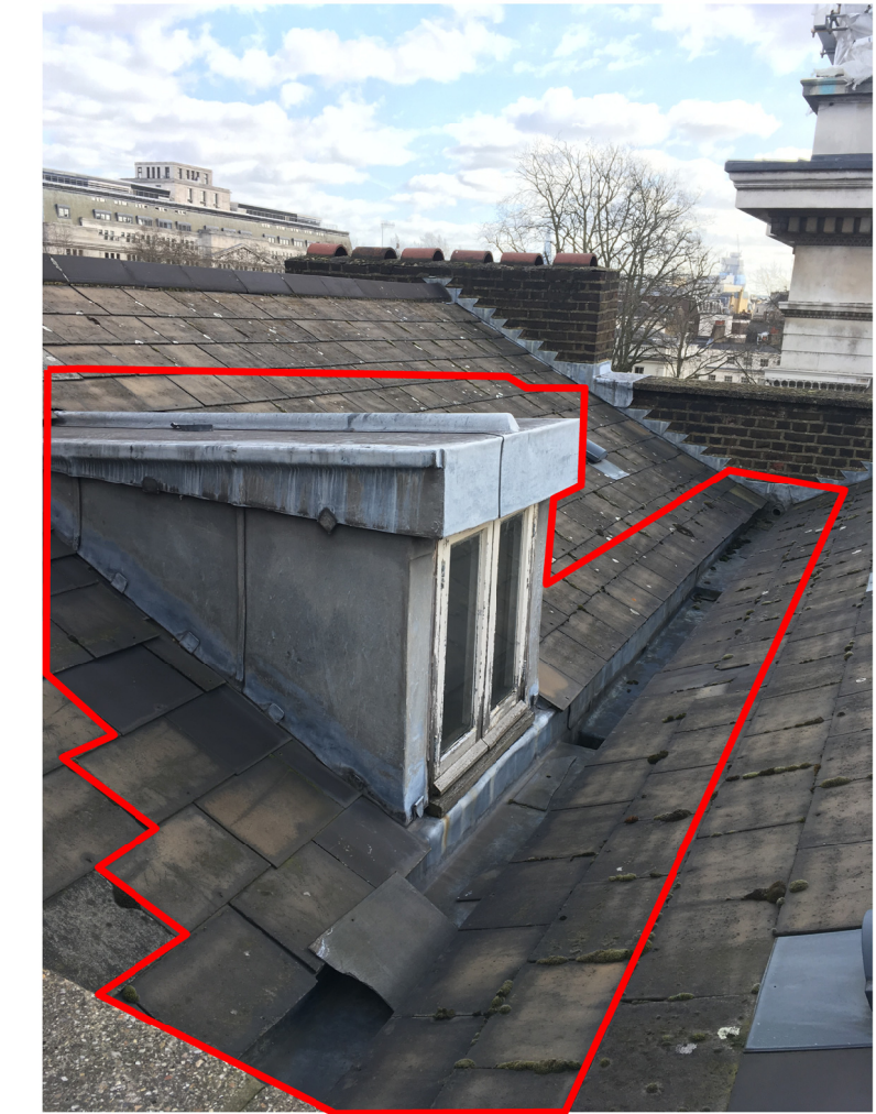
ILLUSTRATION OF SCOPE OF MODIFICATION WORKS