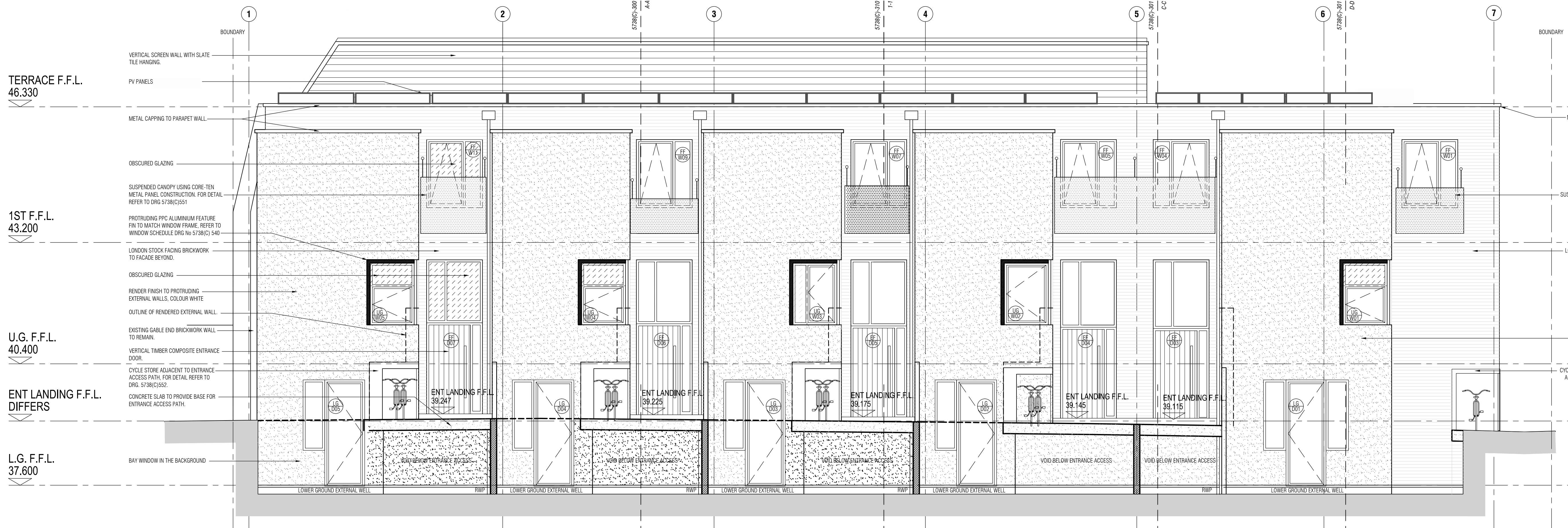
FRONT SOUTH WEST ELEVATION (from College Lane)

NOTE: DRAWING TO BE READ IN CONJUNCTION WITH WINDOW SCHEDULE DRG No 5738(C)540 AND SECTIONS DRG No 5738(C)310 & 5738(C)311.