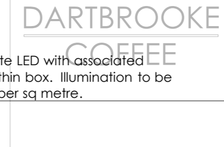
SECTION THROUGH FASCIA SIGN @ Scale 1:10