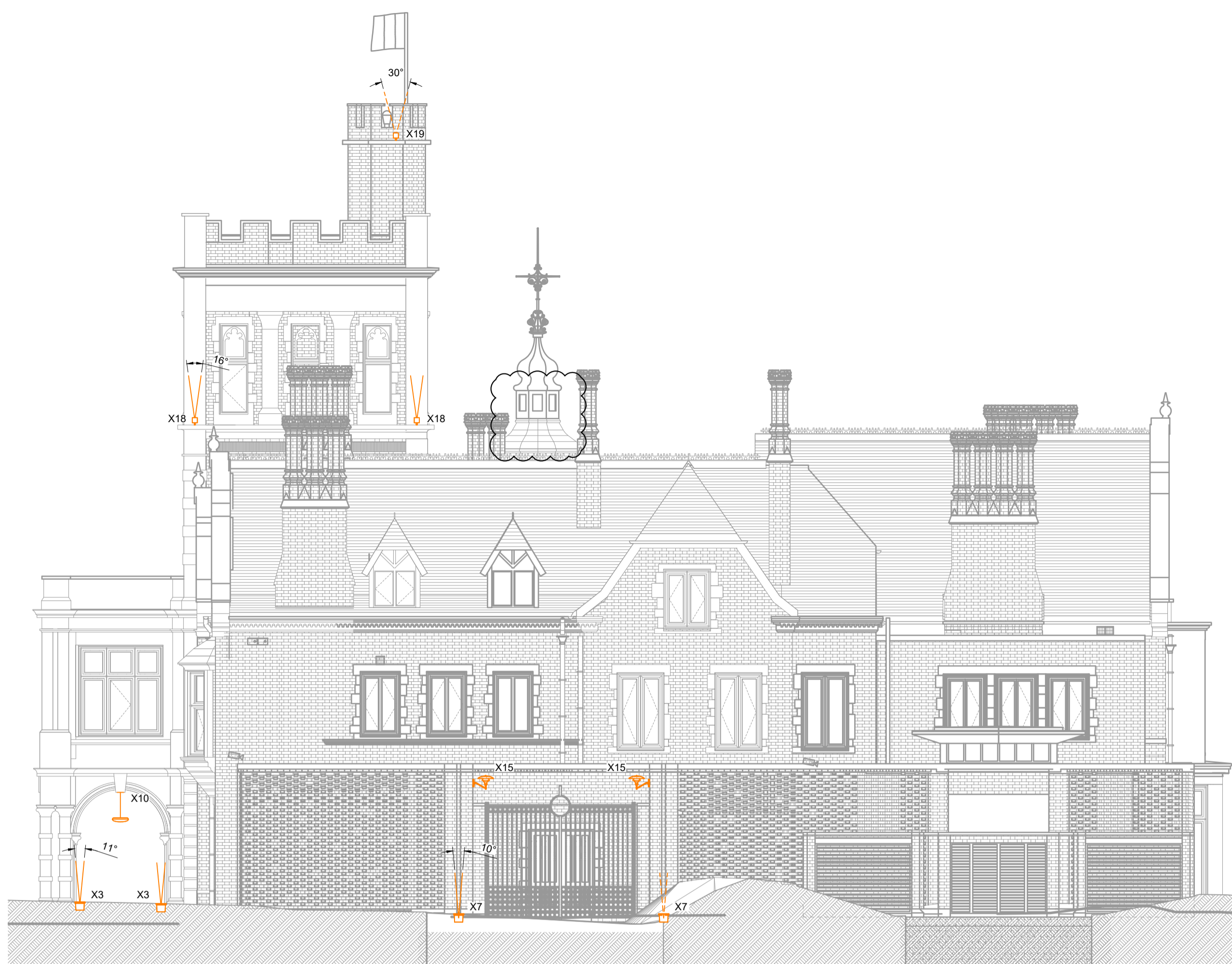
A North Elevation Main House