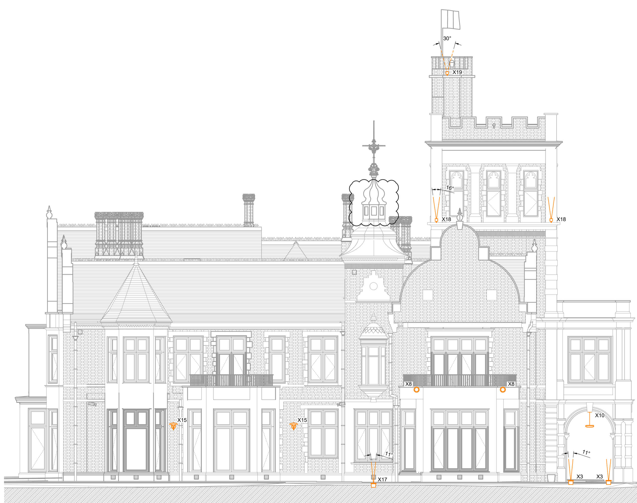
C South Elevation Main House