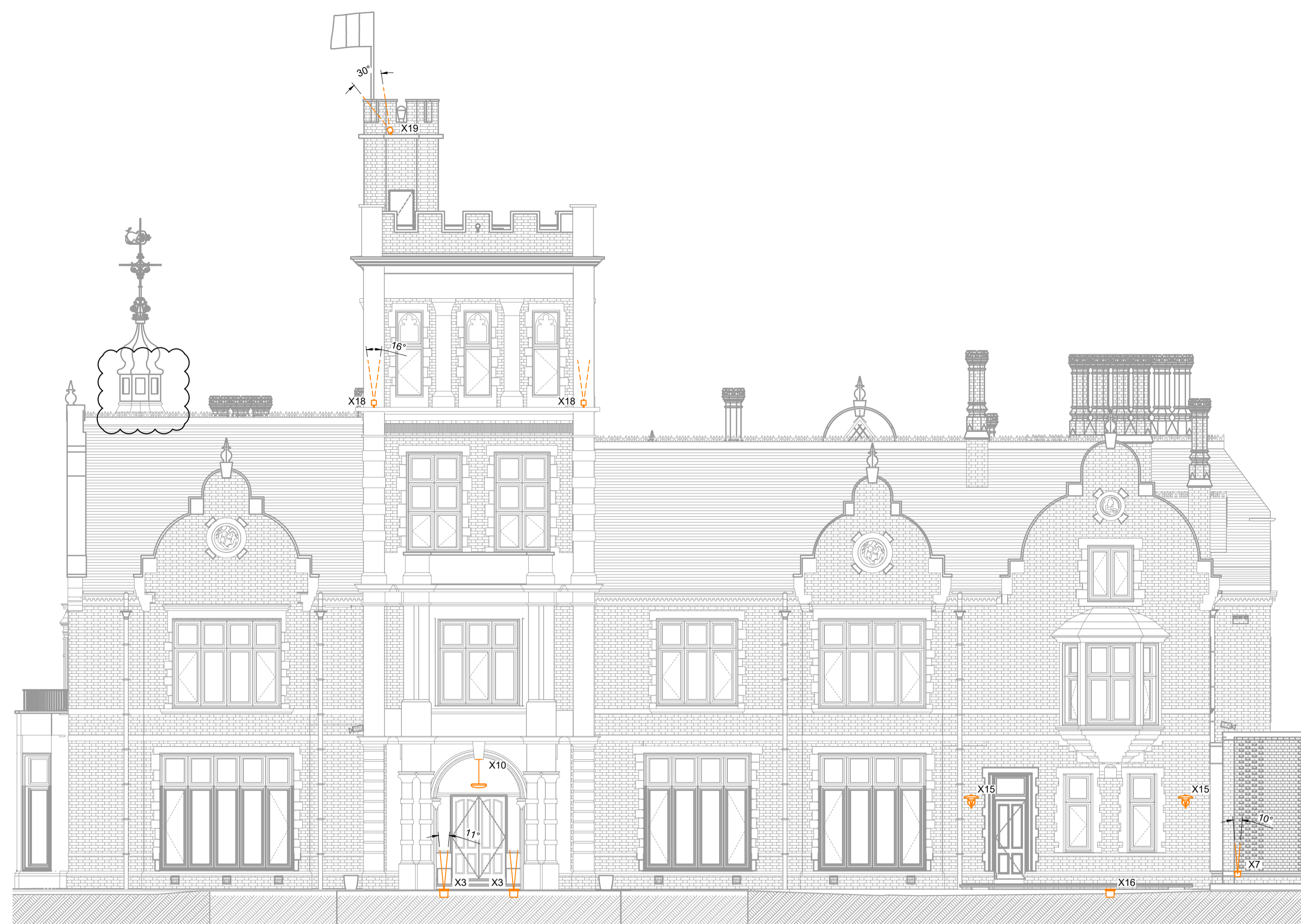
B East Elevation Main House