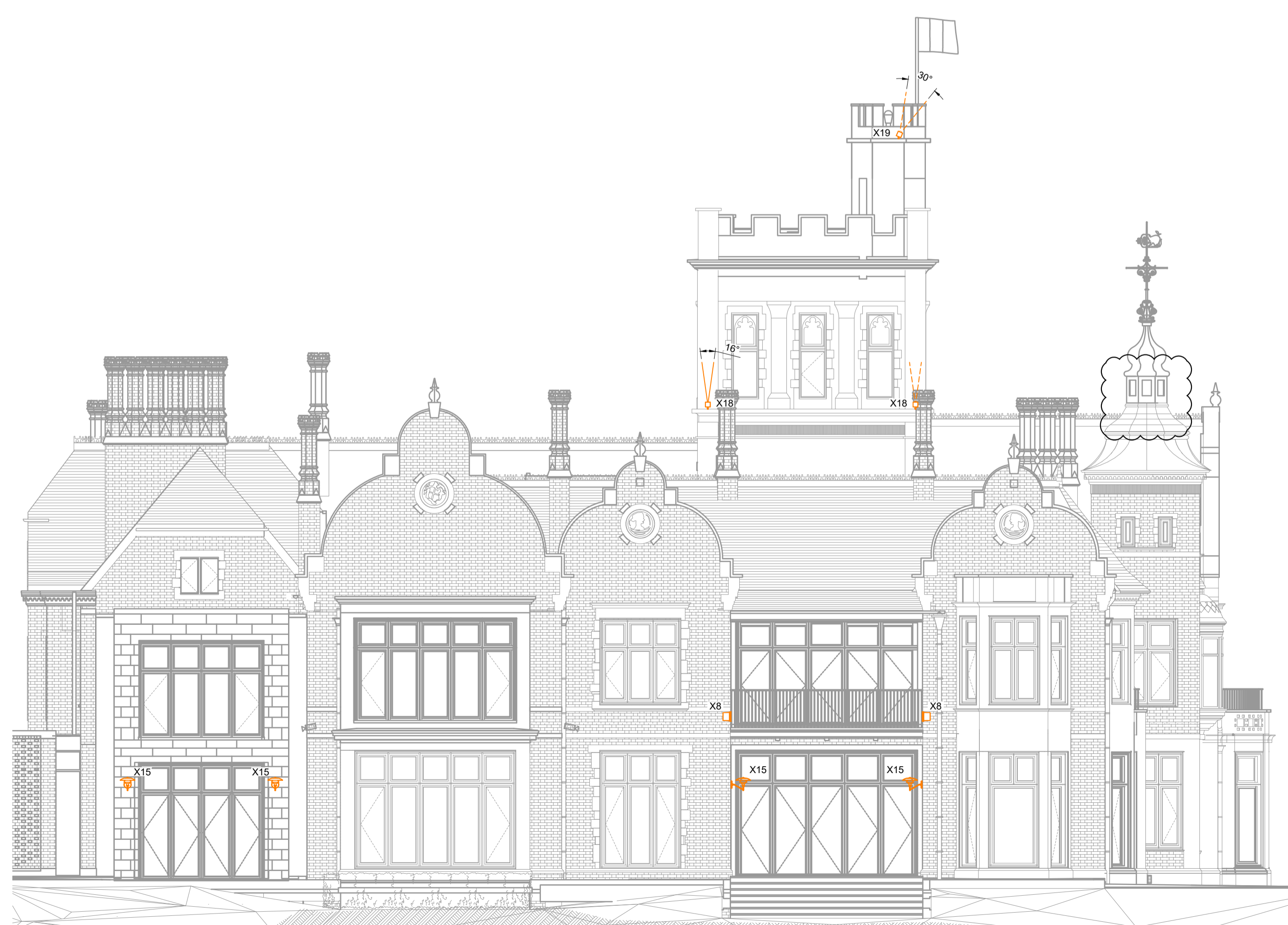
D West Elevation Main House