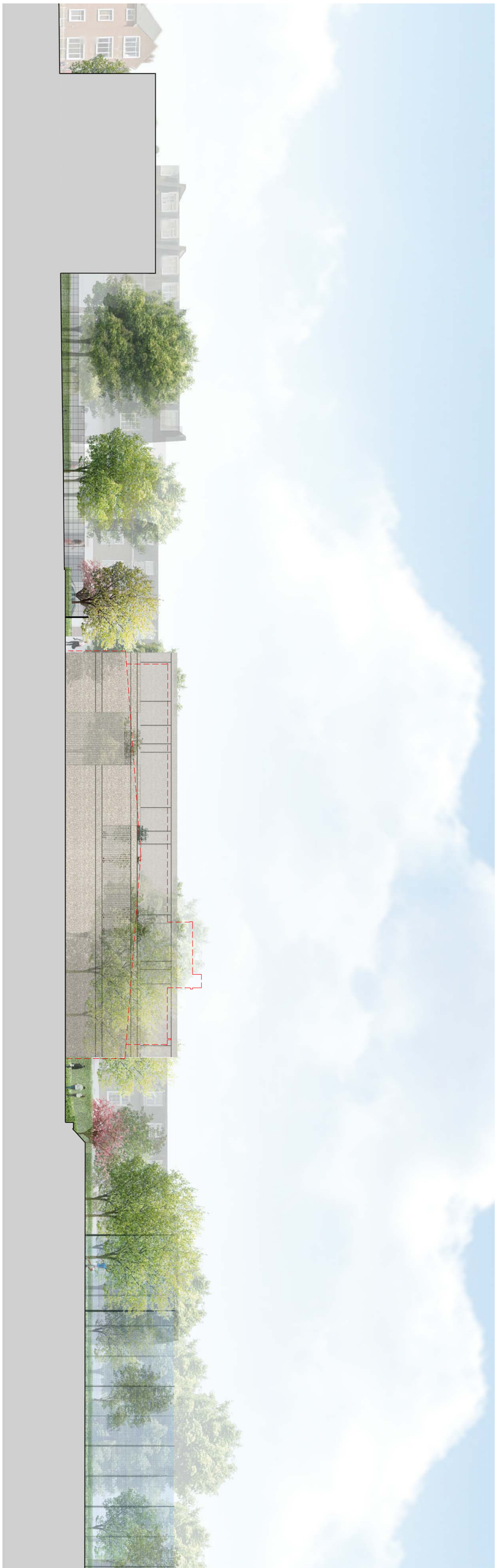
02 Site Section DD