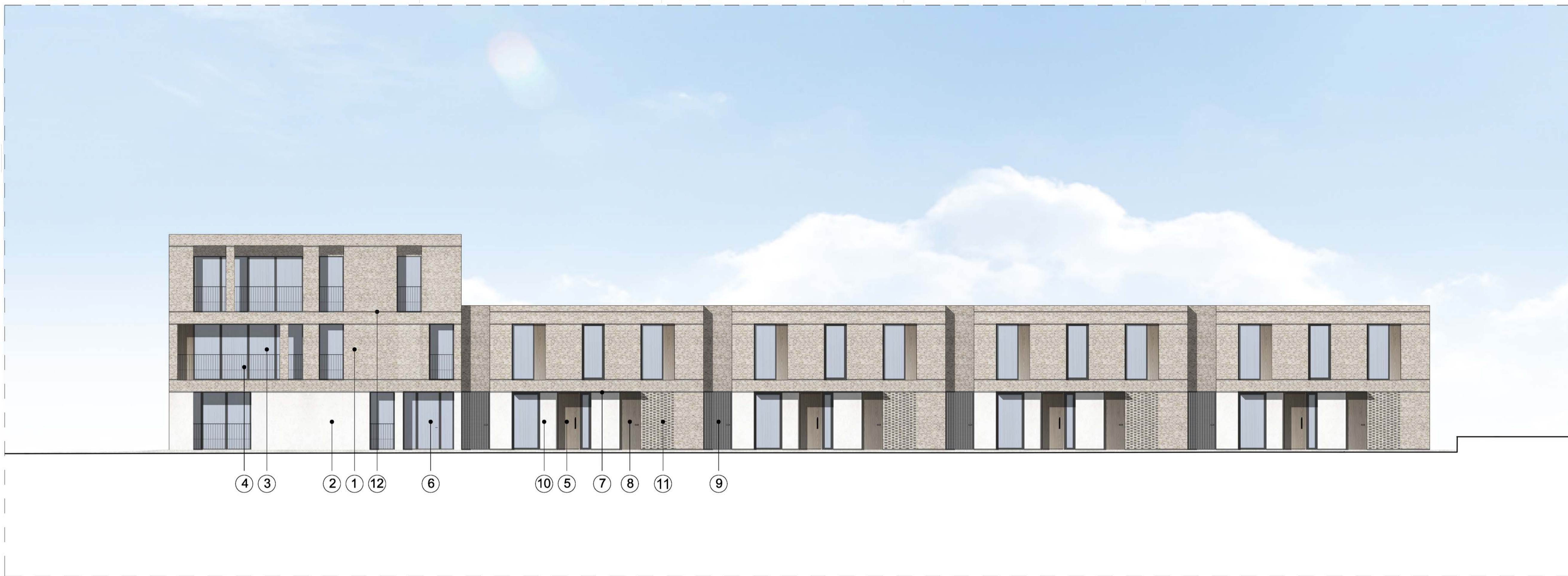
01 South-West Elevation