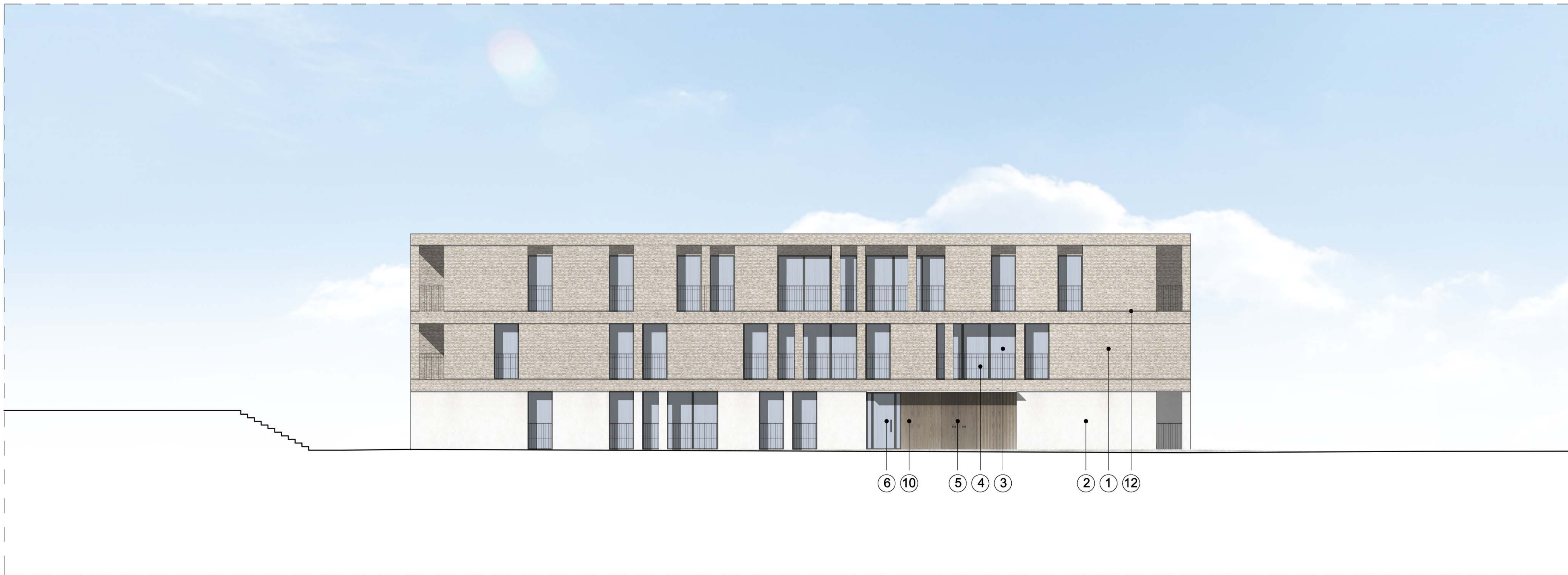
02 North-West Elevation