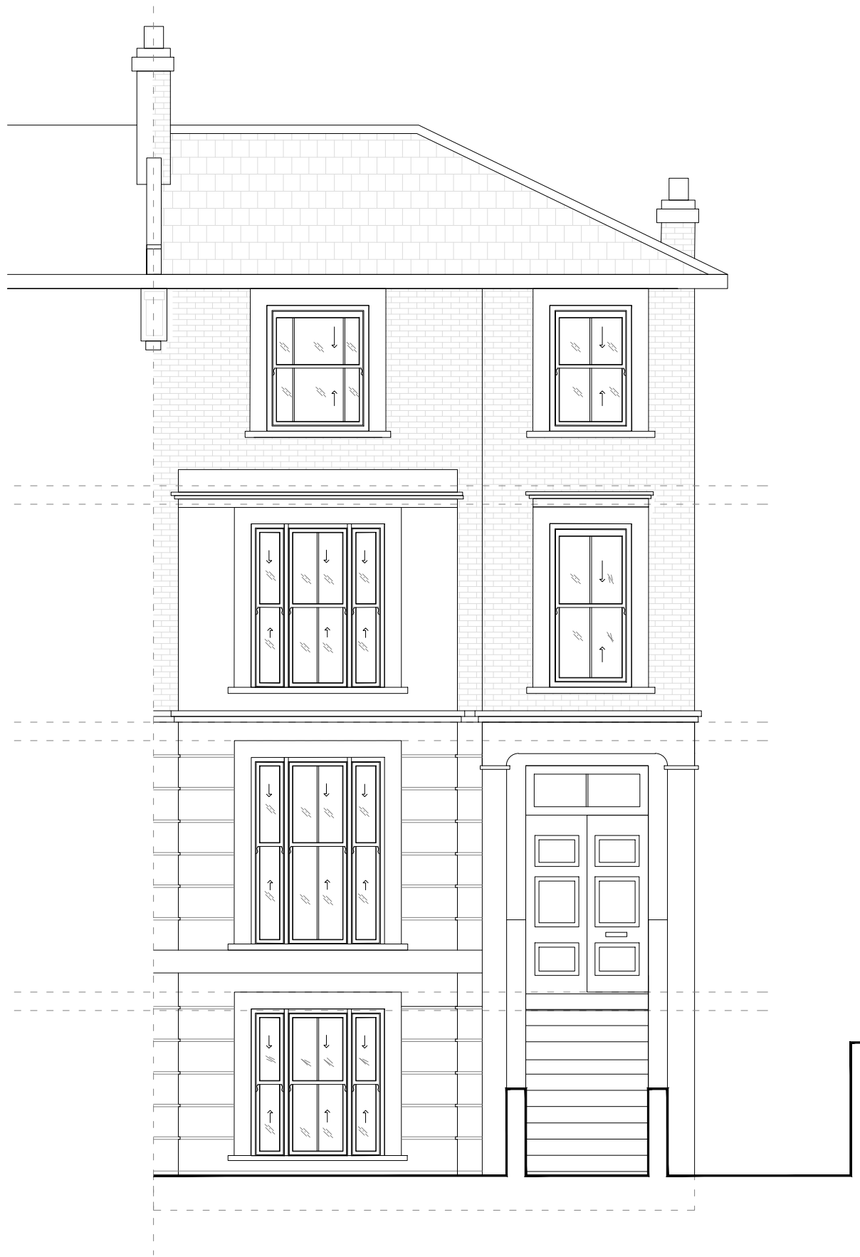
01 Existing Front Elevation 1:100@A3