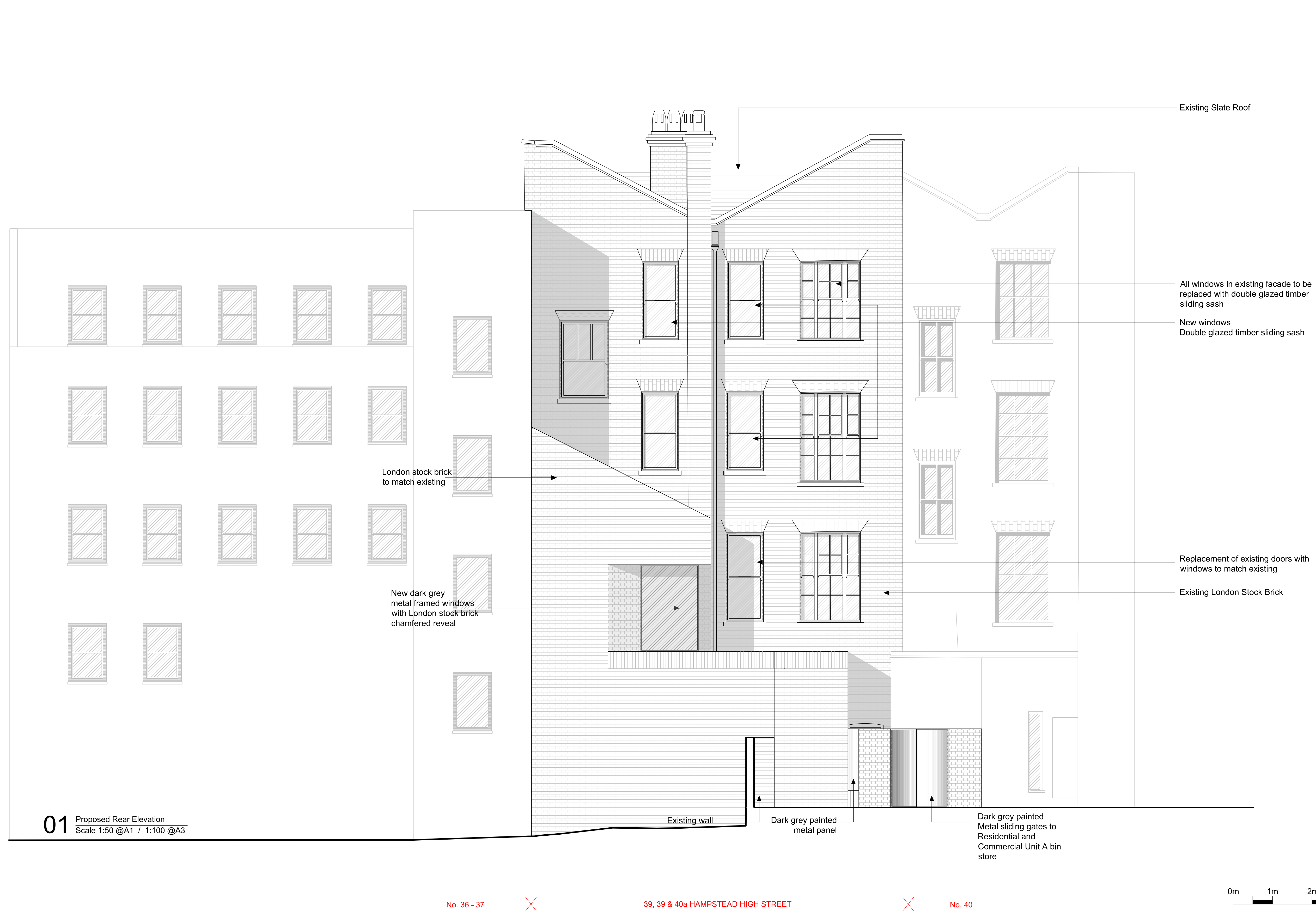
01 Proposed Rear Elevation Scale 1:50 @A1 / 1:100 @A3