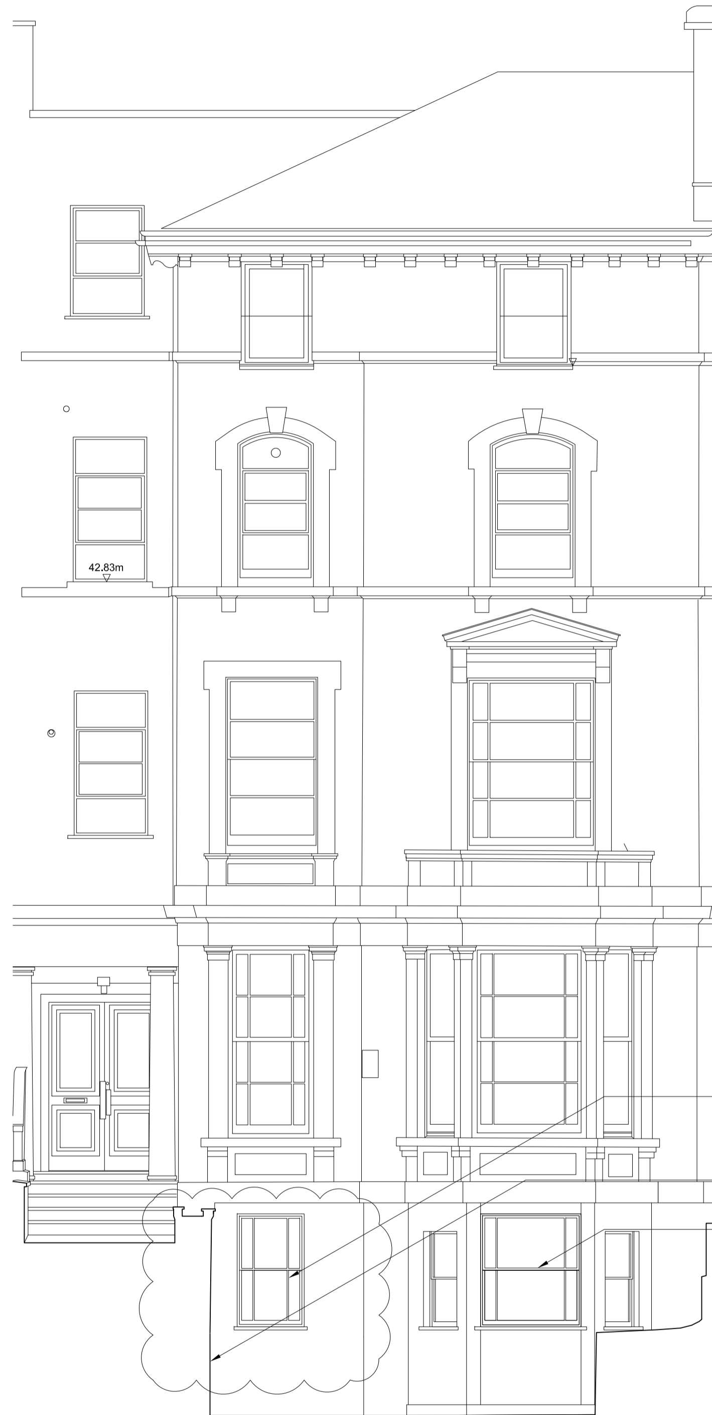
01 FRONT ELEVATION Scale: 1:50 ELEVATION