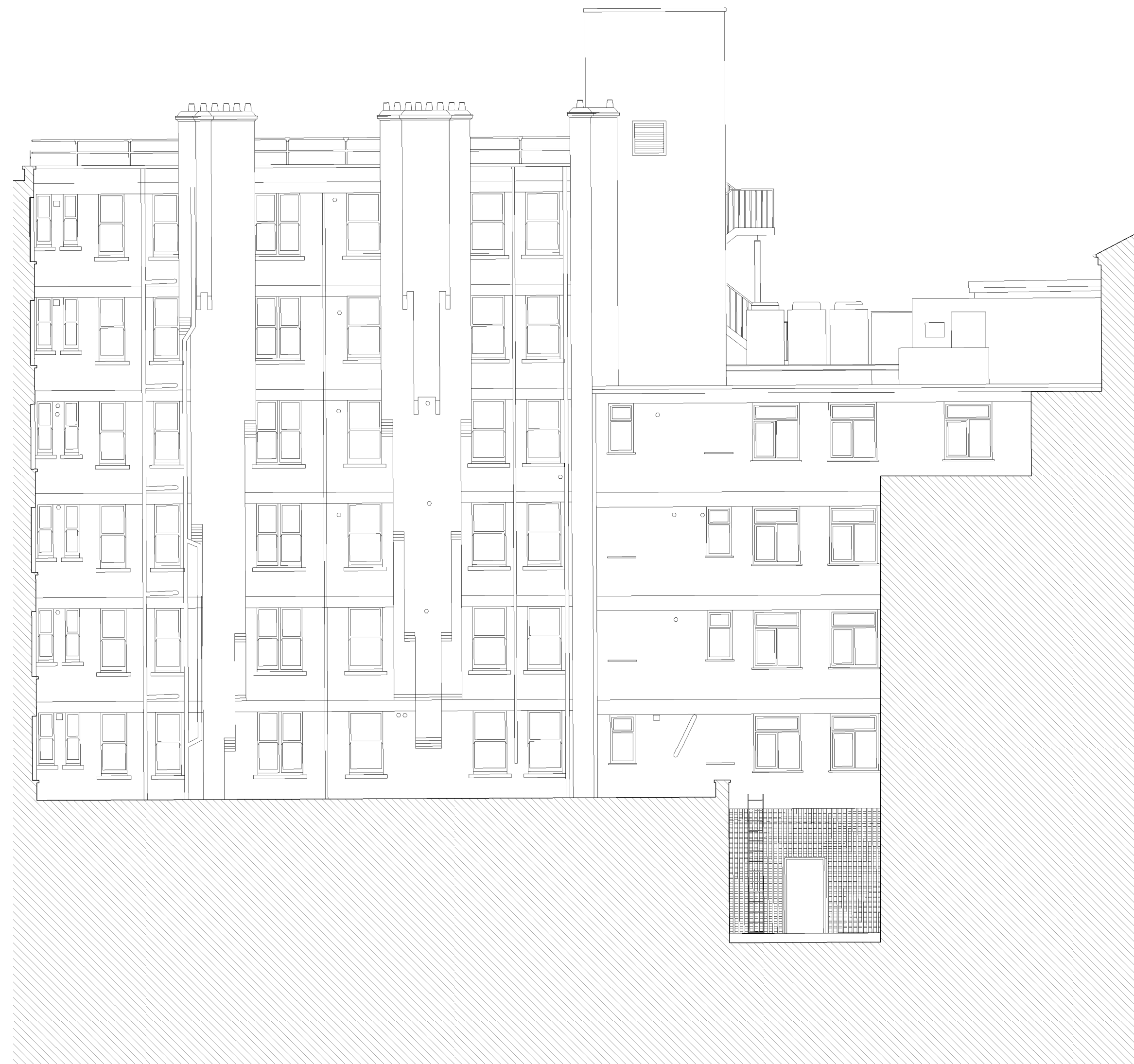
Elevation/Section B - As Existing 1 : 100