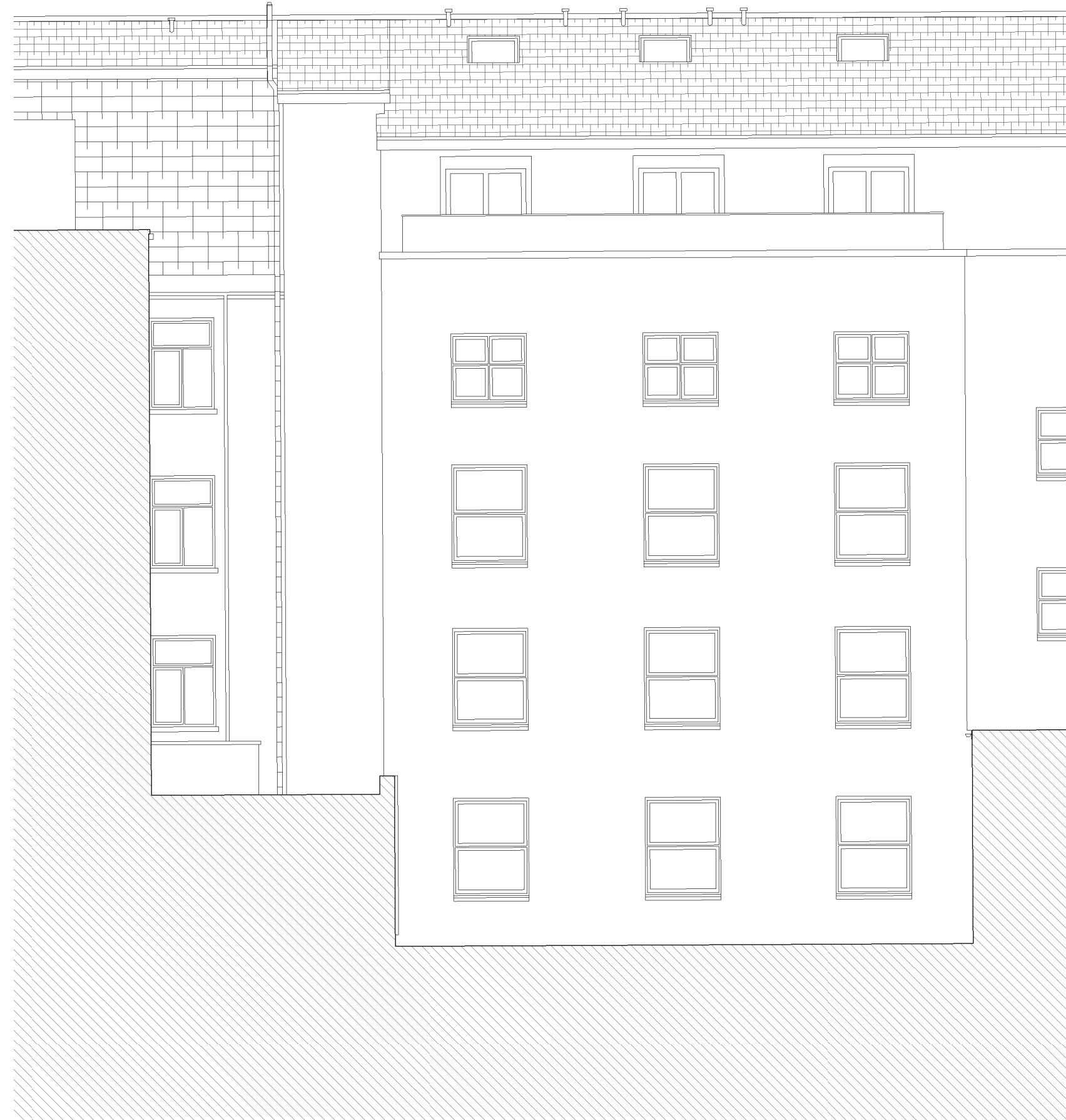
Elevation/Section A - As Existing 1 : 100