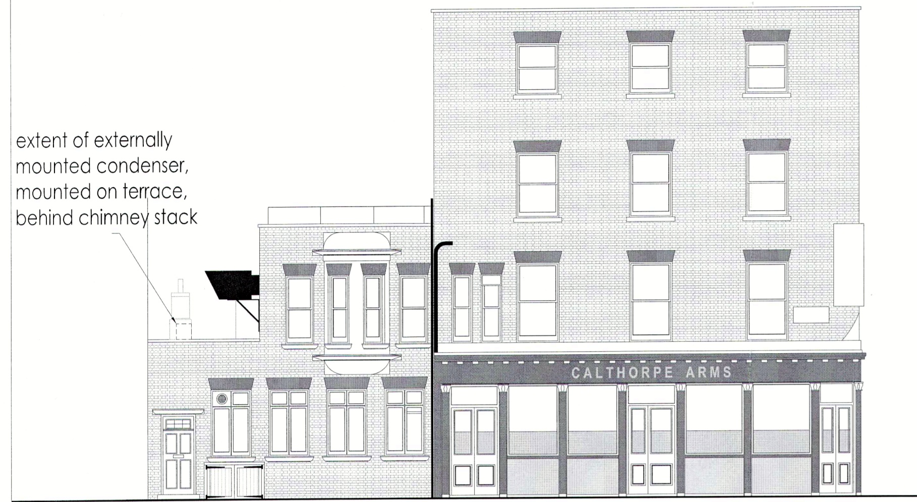
NORTH WEST ELEVATION SCALE 1:100