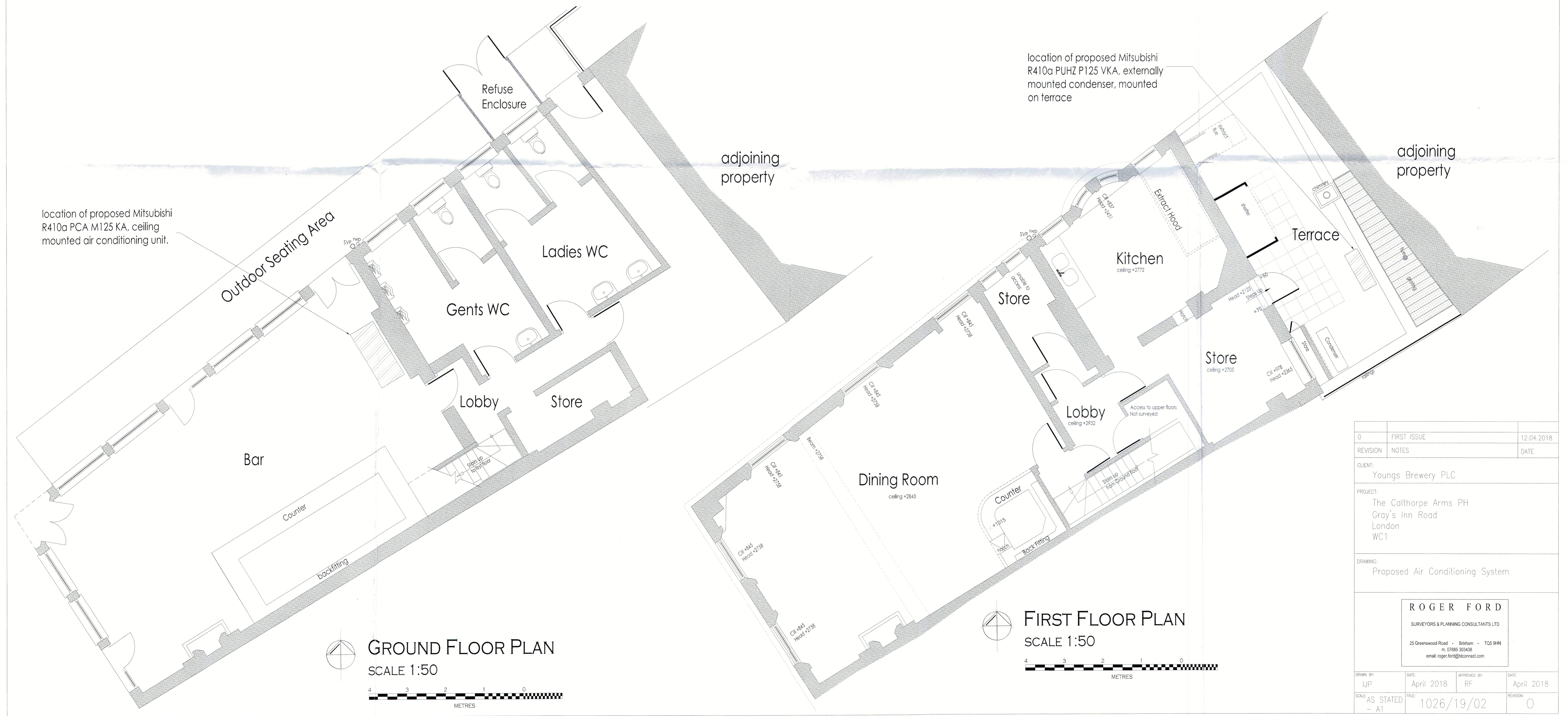
GROUND FLOOR PLAN SCALE 1:50