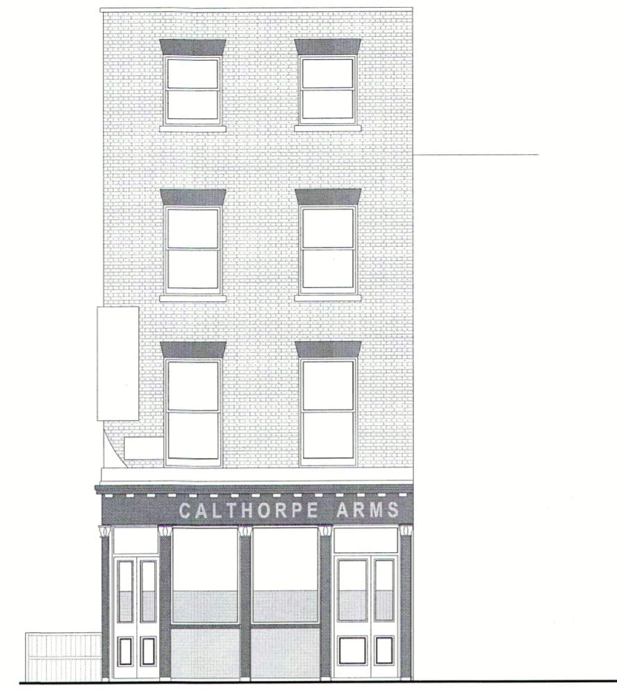
SOUTH WEST ELEVATION SCALE 1:100