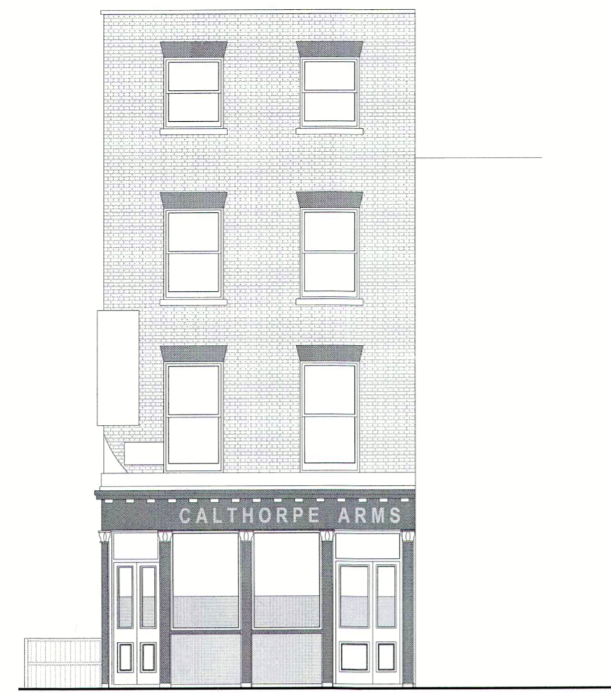
SOUTH WEST ELEVATION SCALE 1:100