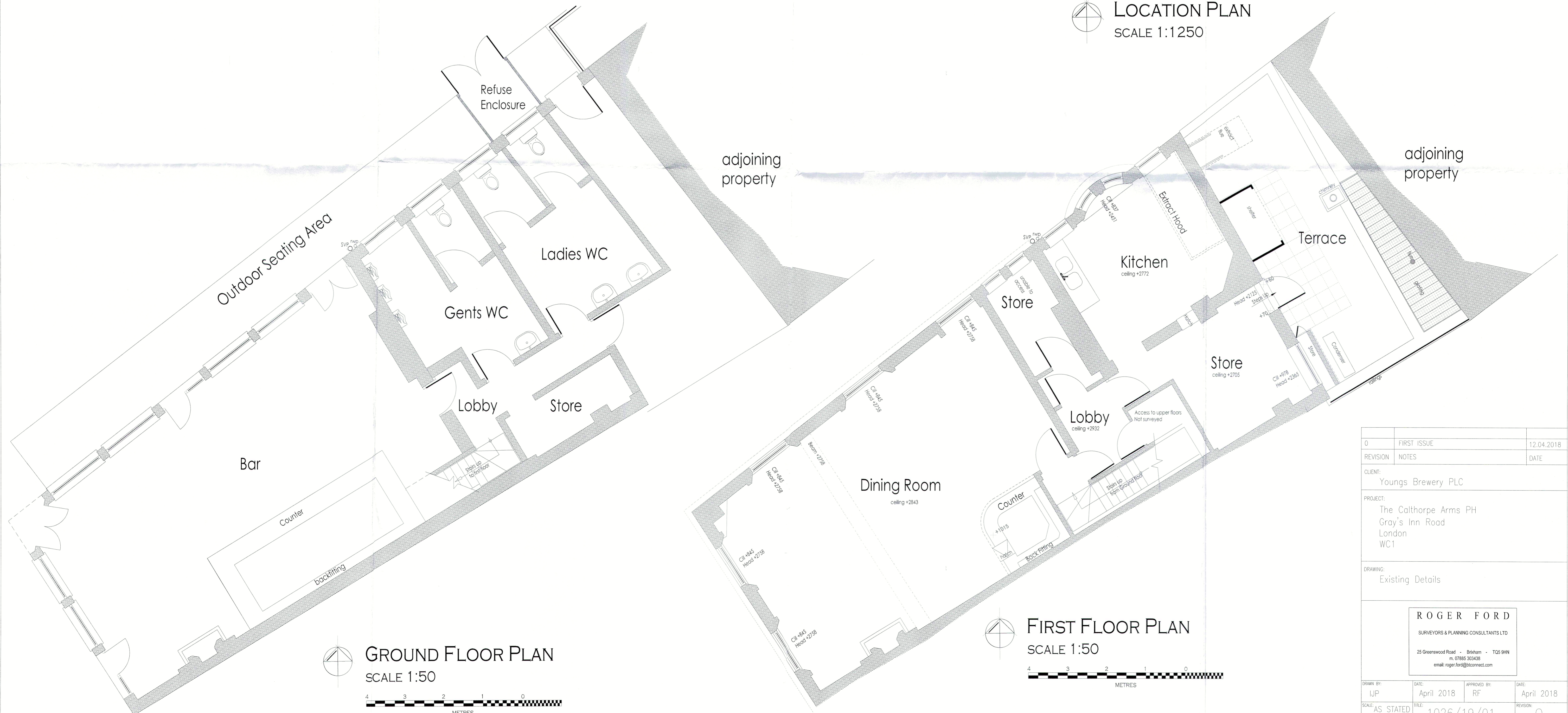
GROUND FLOOR PLAN SCALE 1:50