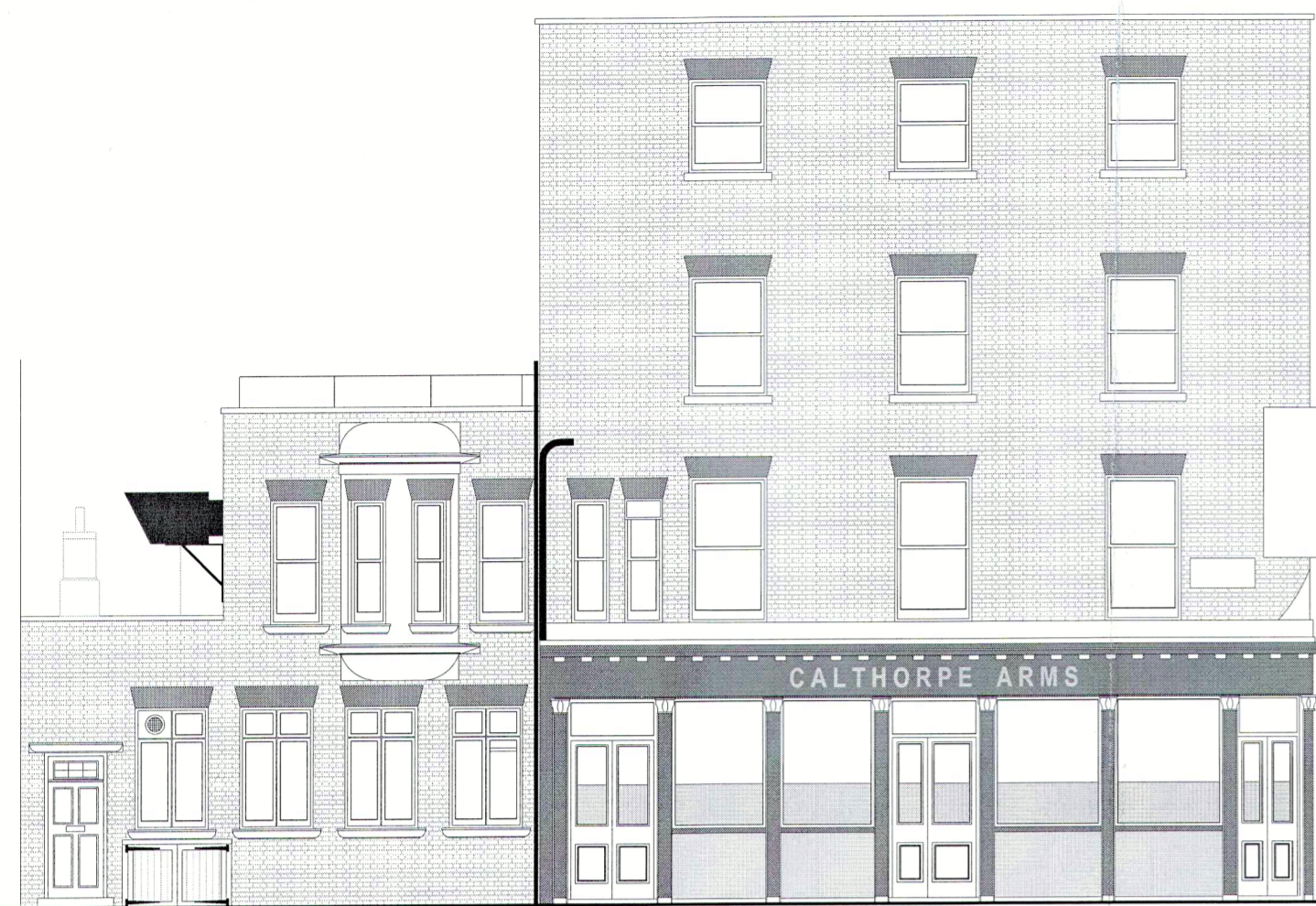
NORTH WEST ELEVATION SCALE 1:100