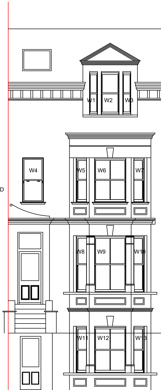
FRONT ELEVATION (Proposed)

PROPOSED TIMBER LIKE FOR LIKE DOUBLE GLAZED WINDOW TO MATCH THE EXISTING.