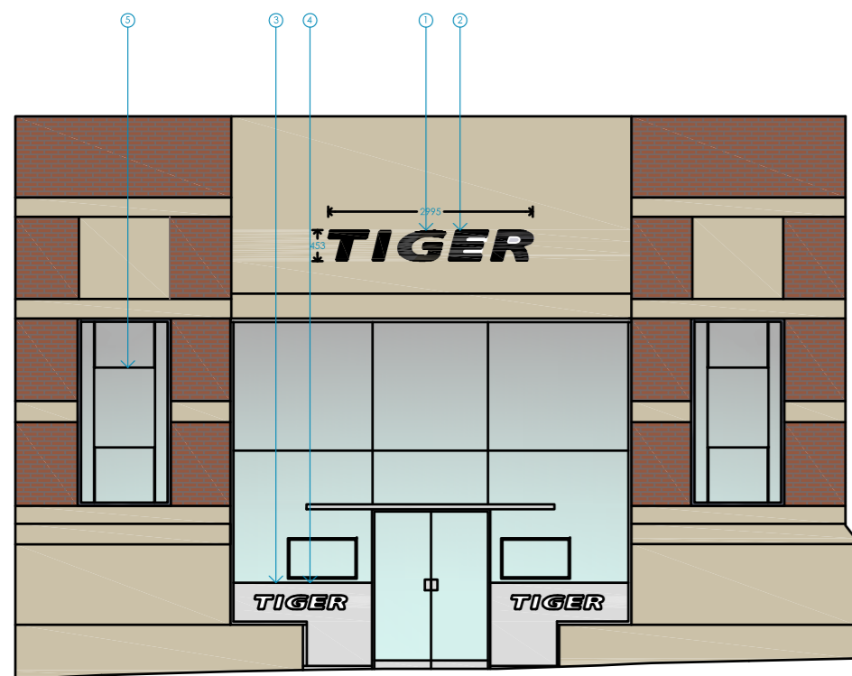
01 EXISTING ELEVATION