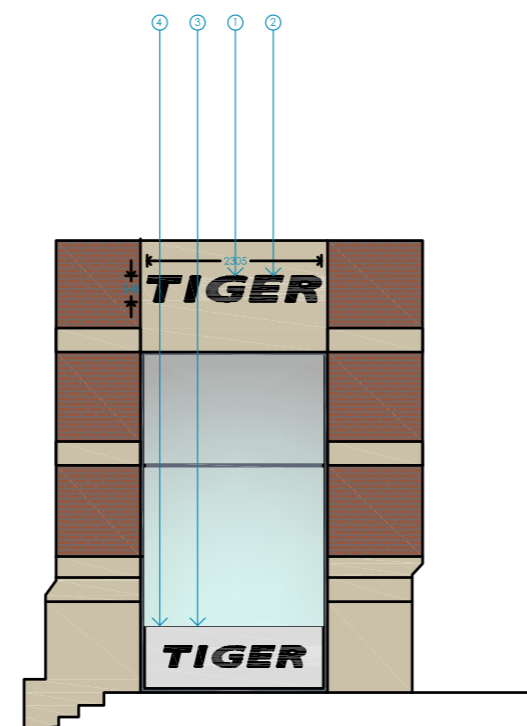
02 EXISTING SIDE ELEVATION