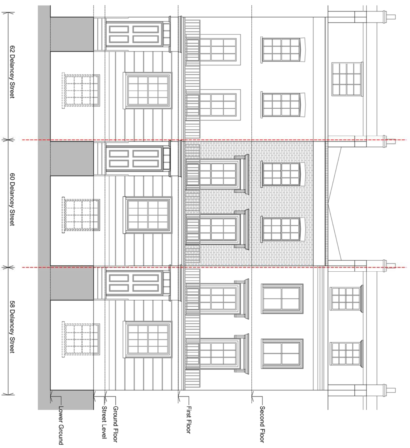
① Existing Elevation Delancey Street - Front South Elevation