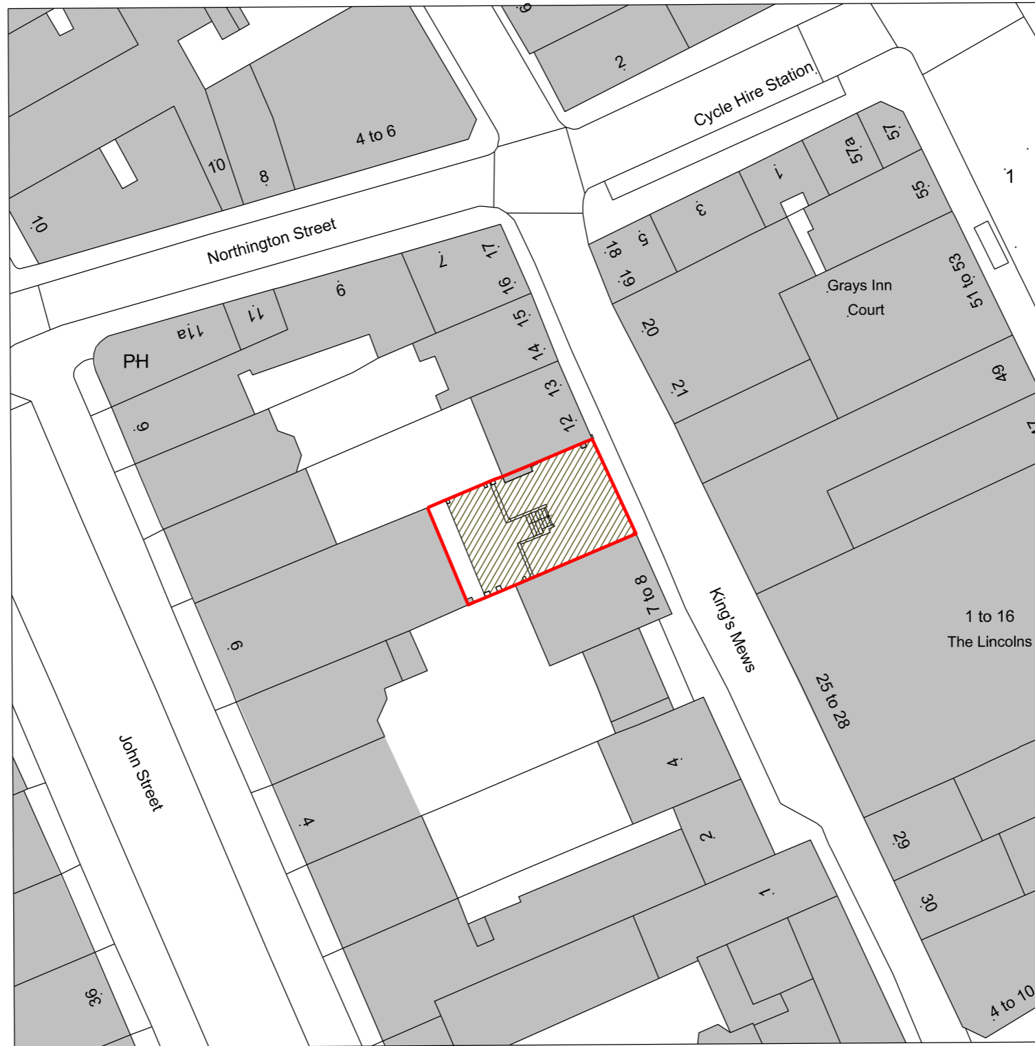
01 Block Plan JTH02_P002 SCALE 1:500@A3

General Notes: This drawing is copyright of Matthew Allchurch Architects Limited