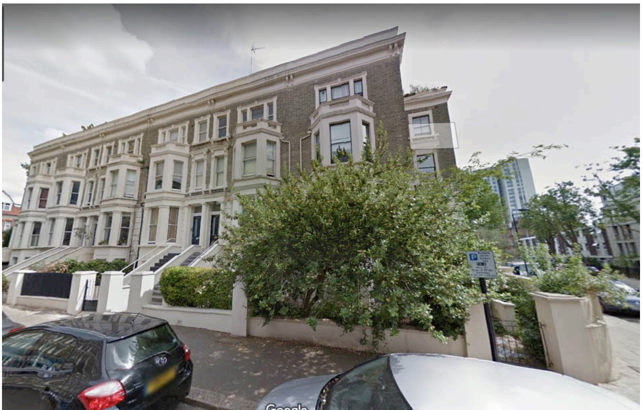
VIEW OF EXSITING WINCHESTER ROAD ELEVATION