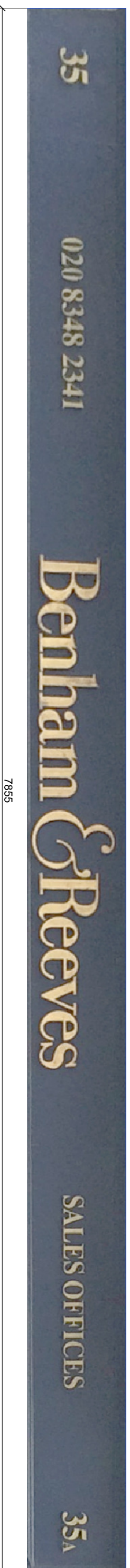
2 / Proposed Shop front, Scale 1:20