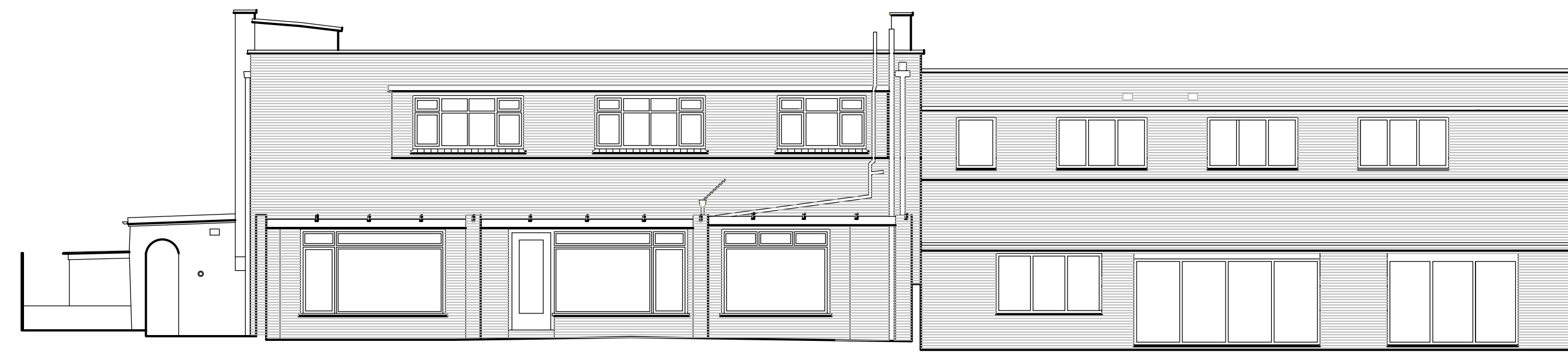
4 FROGNAL CLOSE 3 FROGNAL CLOSE SOUTH WEST (REAR) ELEVATION AS EXISTING 1:100@ A1