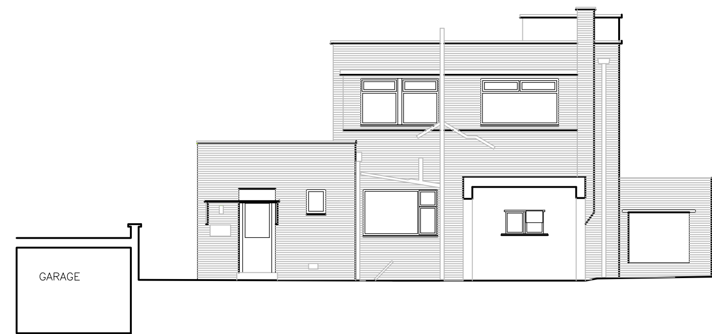
SECTION C-C (SIDE ELEVATION) AS EXISTING 1:100@ A1