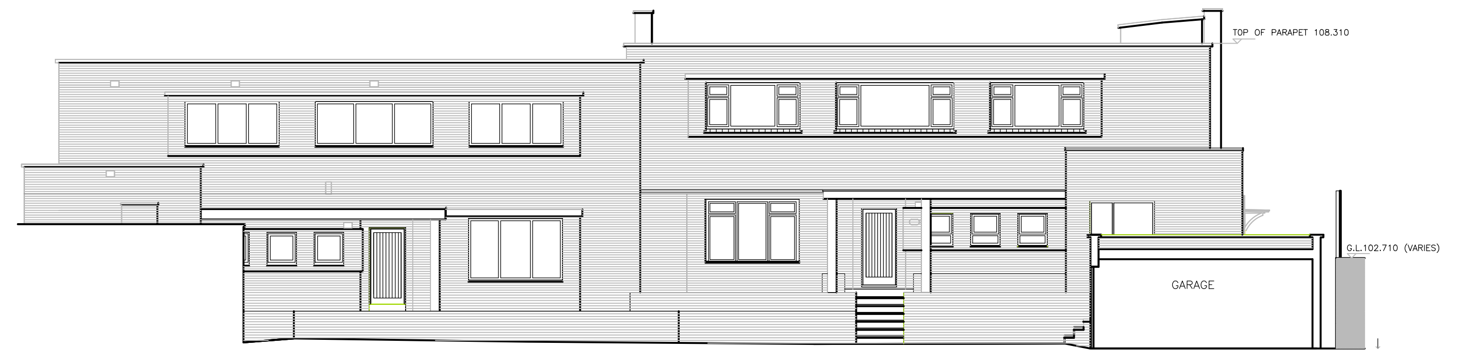
3 FROGNAL CLOSE 4 FROGNAL CLOSE NORTH EAST (FRONT) ELEVATION AS EXISTING 1:100@ A1