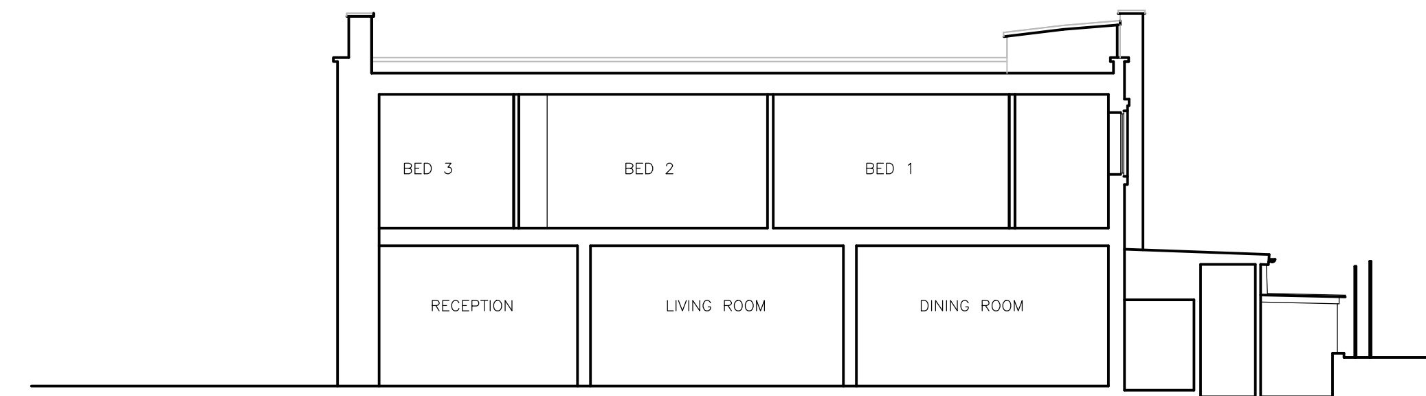
SECTION D-D AS EXISTING 1:100@ A1

ELEVATION AND SECTIONS AS EXISTING 1:100@A1