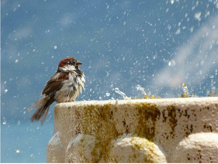
Examples of the proposed bird bath in the garden to enhance biodiversity in the garden