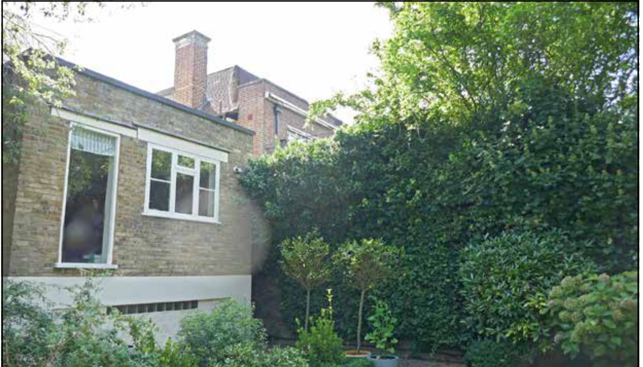
IMG-10 - High site perimeter boundaries