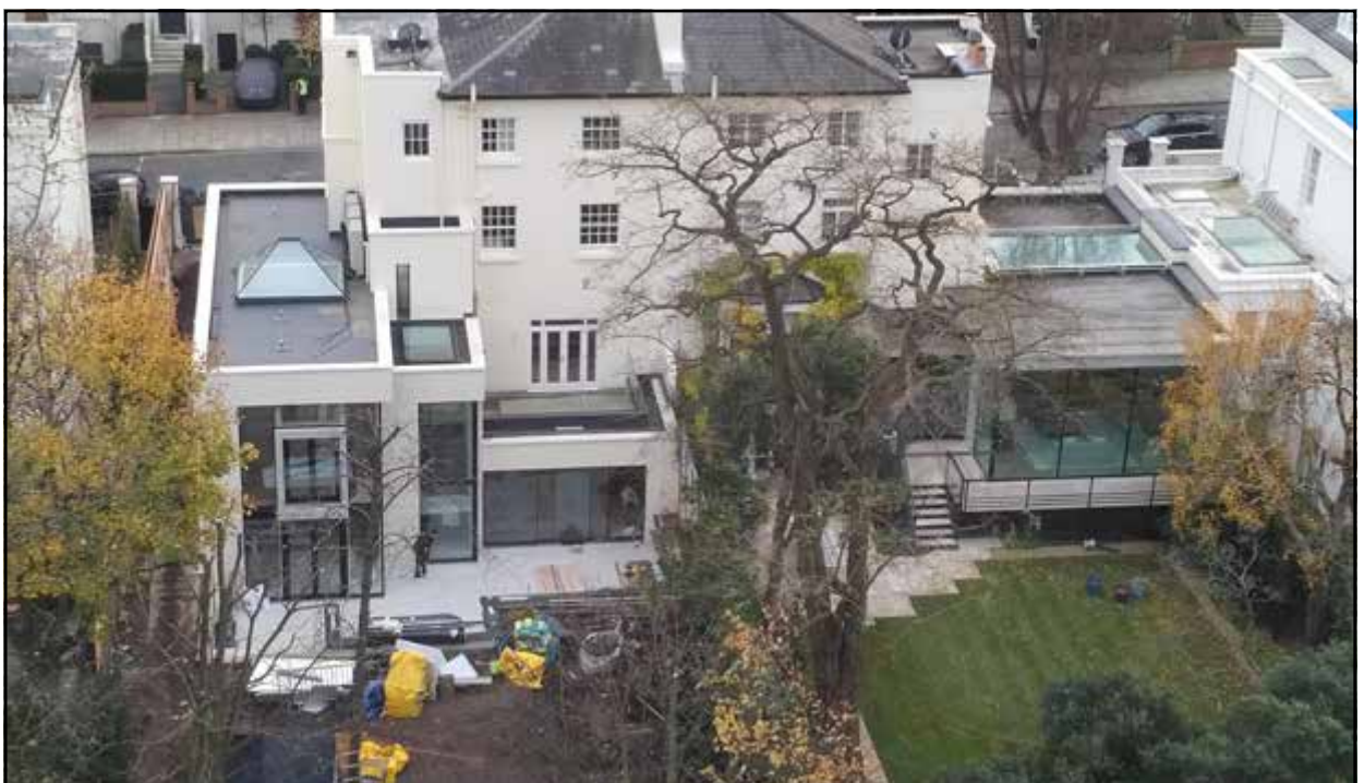
IMG-13 - Aerial - Large and modern rear extensions to the rear of adjacent properties