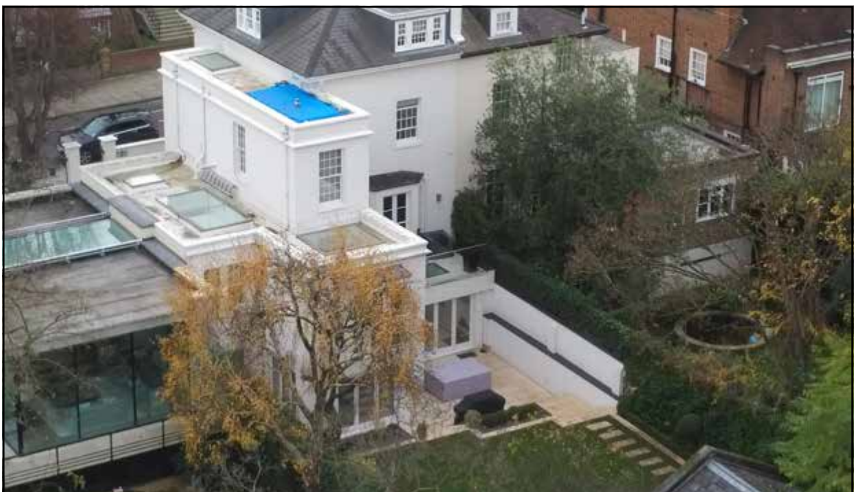
IMG-02 - Aerial - Neighbouring properties with contemporary rear extensions