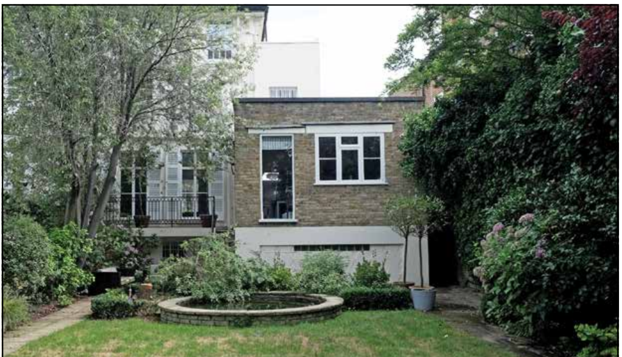
IMG-05 - Rear - Existing facing bricks to be matched where specified in proposed extension