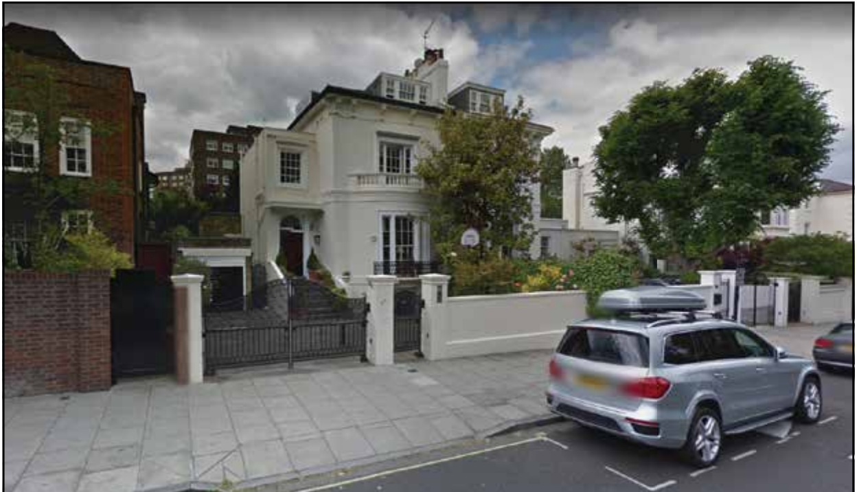
IMG-04 - Front - Existing architectural detailing to be matched