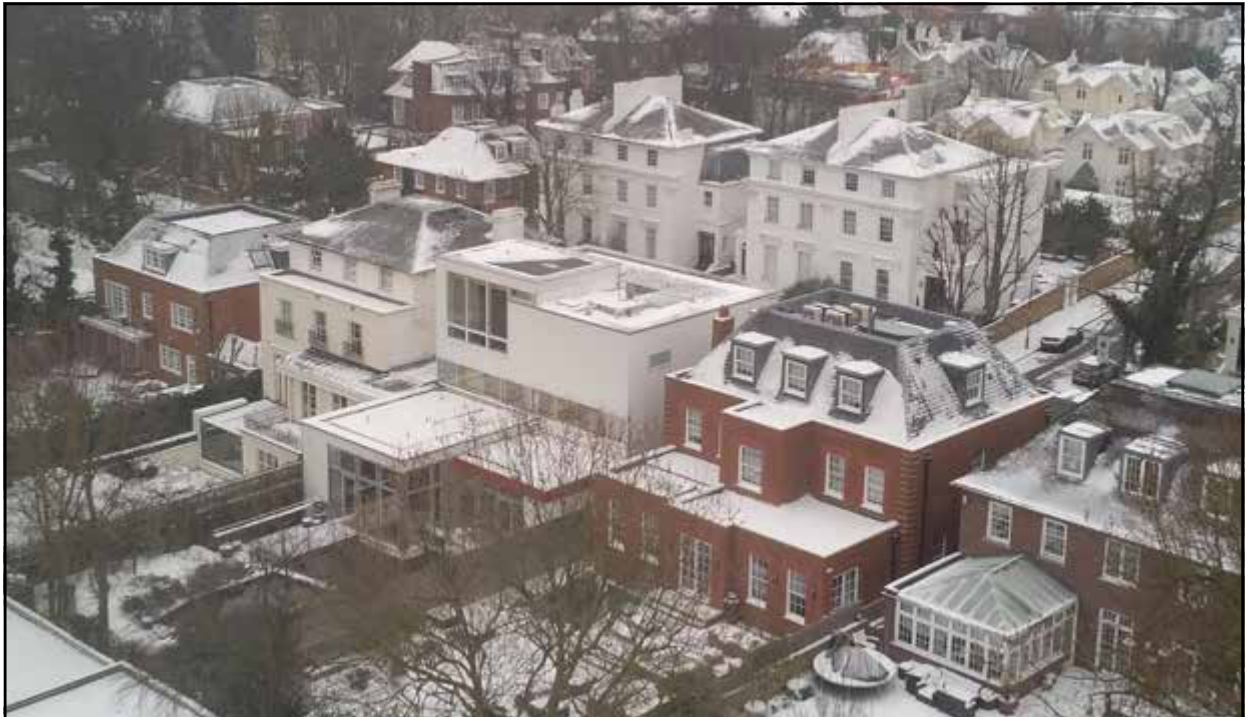
IMG-12 - Aerial - Large and modern rear extensions to the rear of adjacent properties