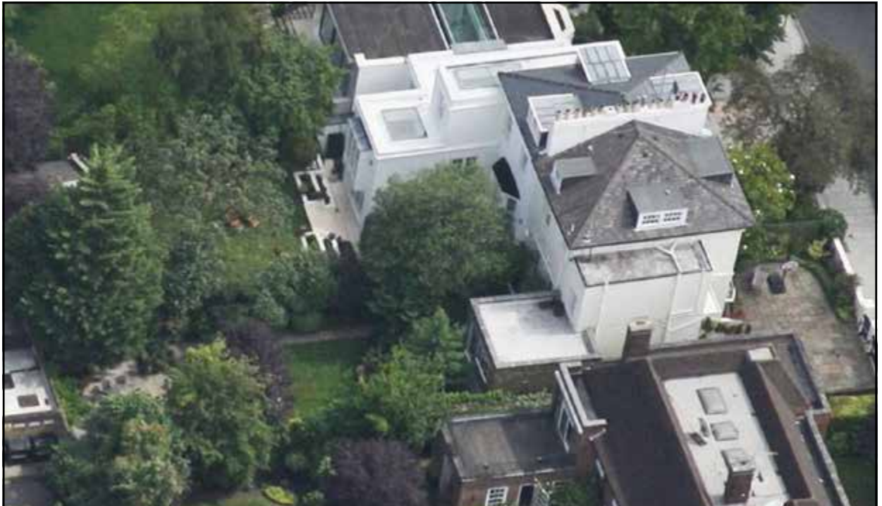
IMG-01 - Aerial - Building line established by previous neighbouring extensions