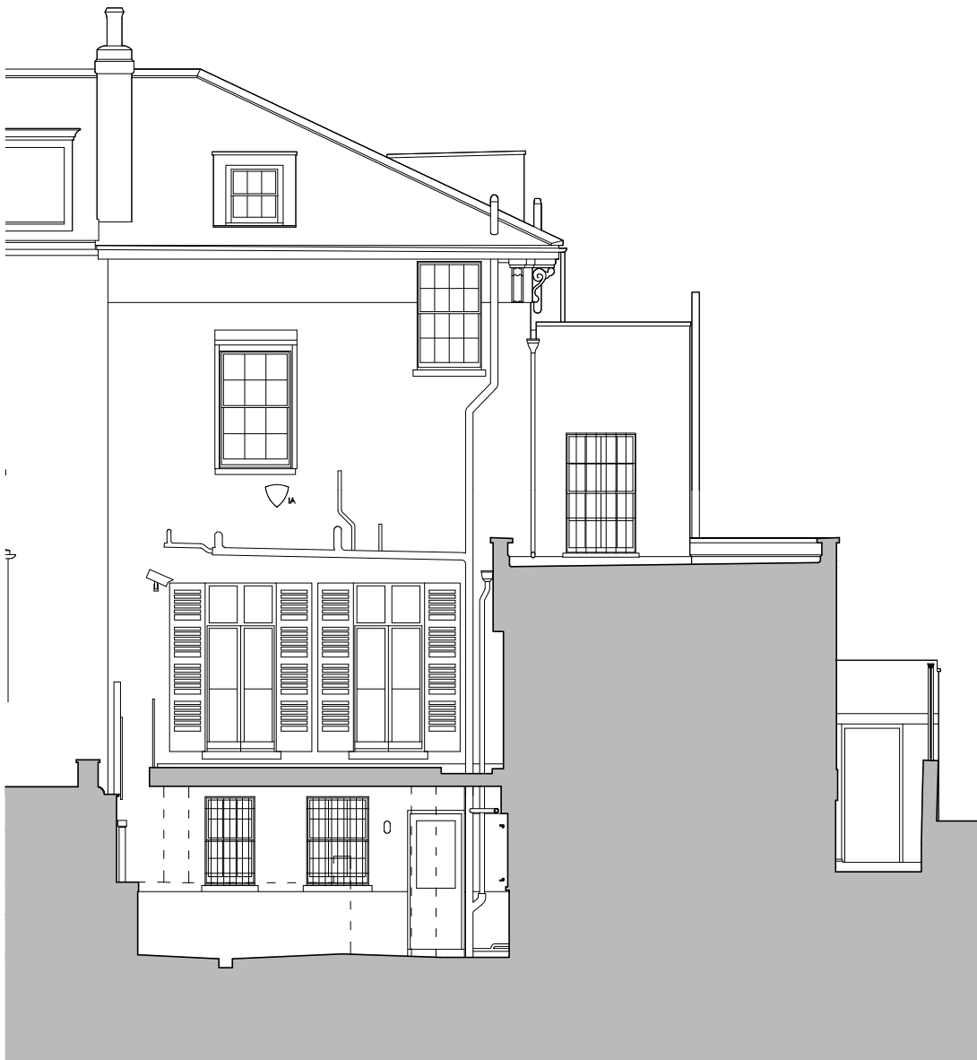
ELEVATION REAR (NW) - SECTION THROUGH EXISTING KITCHEN 1:100