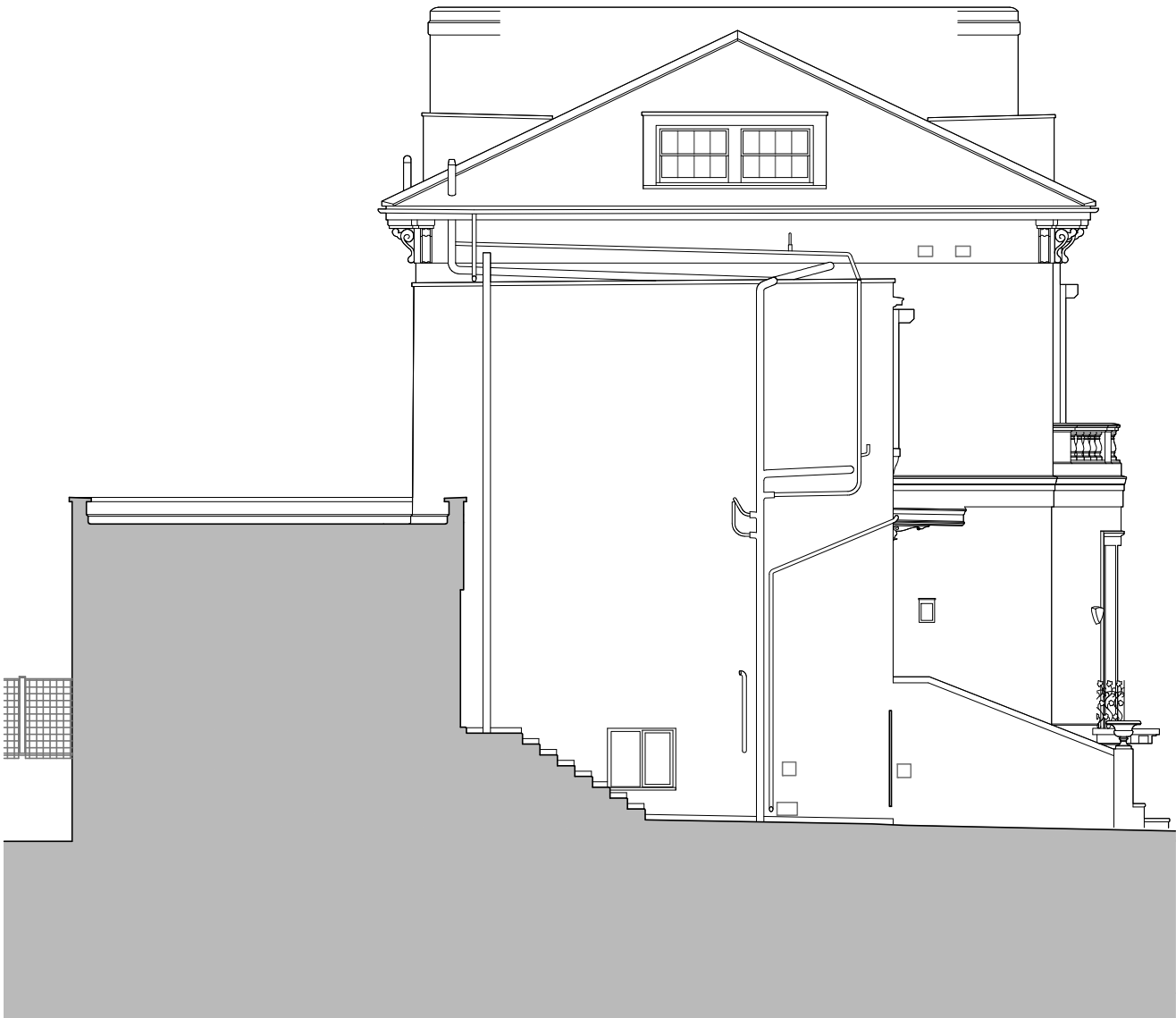
ELEVATION FLANK (SW) - SECTION THROUGH EXISTING KITCHEN 1:100

This drawing is the copyright of Red Squirrel AK Ltd. T/A Camouflage. Figured dimensions to be taken in preference to those scaled. All dimensions to be checked on site before any work proceeds. The contractor is to provide full size setting out drawings based on the information contained in this drawing for the designer approval prior to commencing manufacture. This drawing is issued on the condition that it is not reproduced, retained, or disclosed to any un-authorised person either wholly or in part without the consent in writing of: Camouflage, 8a Bartlett Street, Bath BA1 2QZ