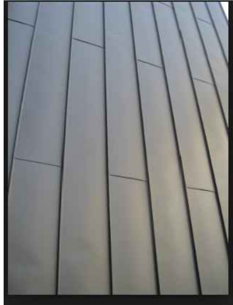
VERTICAL ZINC STANDING SEAM WITH STAGGERED JOINT LINES