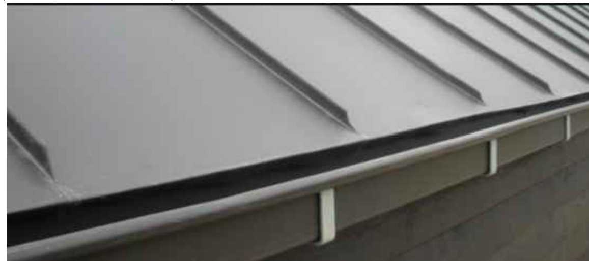
ZINC STANDING SLOPING ROOFING TO NORTH FACING REAR ELEVATION