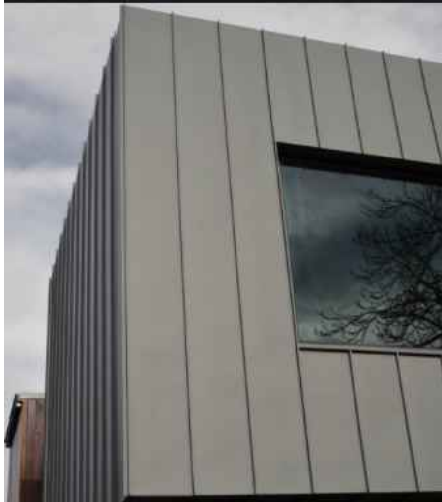
VERTICAL ZINC STANDING SEAM TO FIRST FLOOR CLADDING (EAST AND WEST ELEVATIONS)