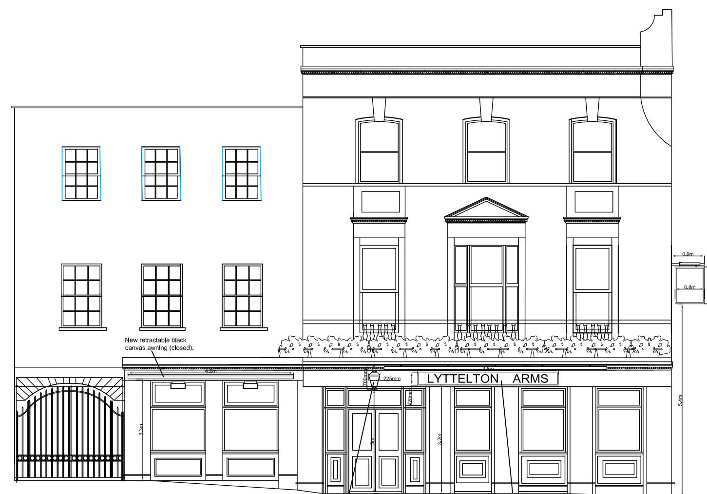
Proposed Elevation to Mornington Crescent. Scale 1:100