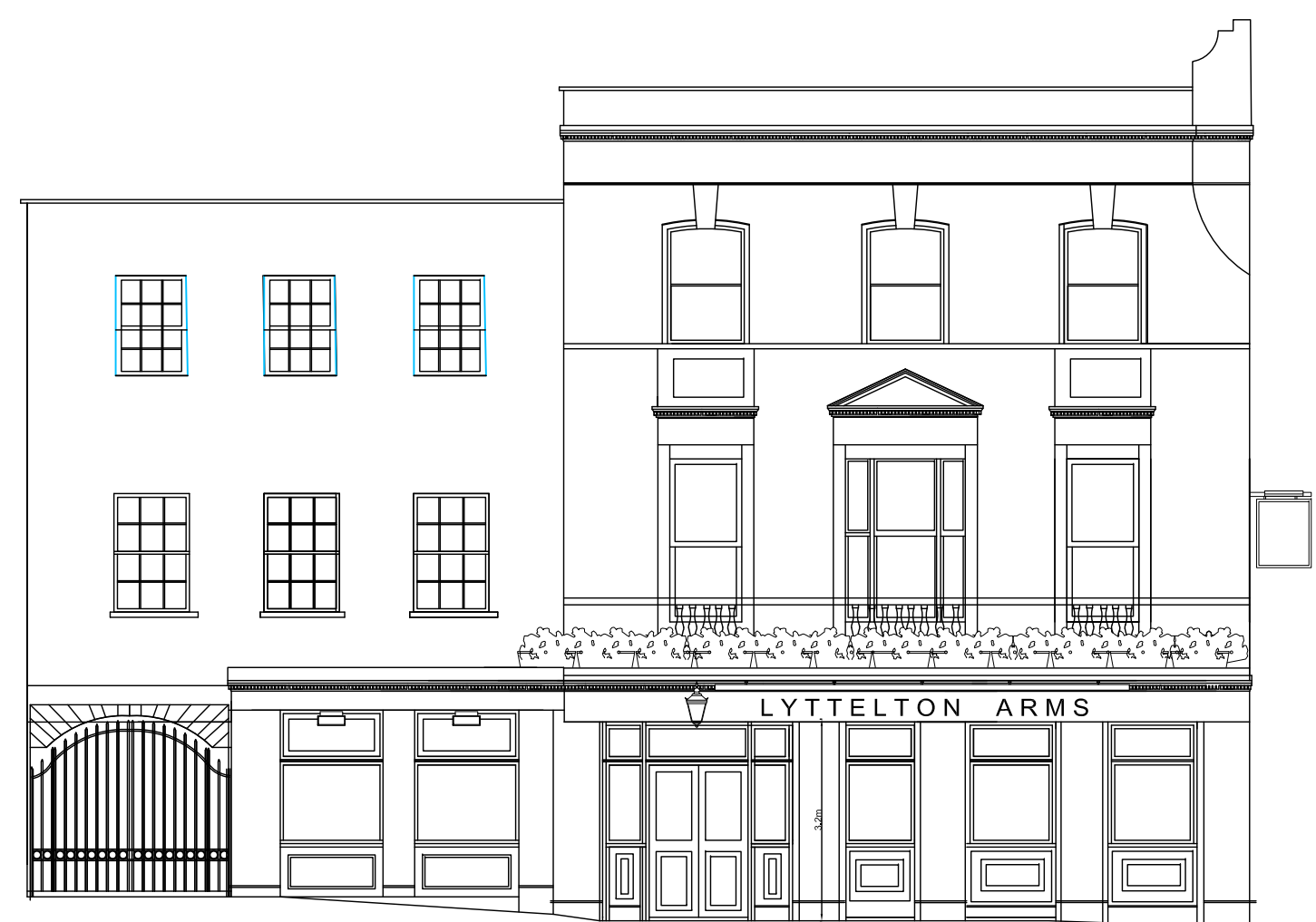
Existing Elevation to Mornington Crescent. Scale 1:100