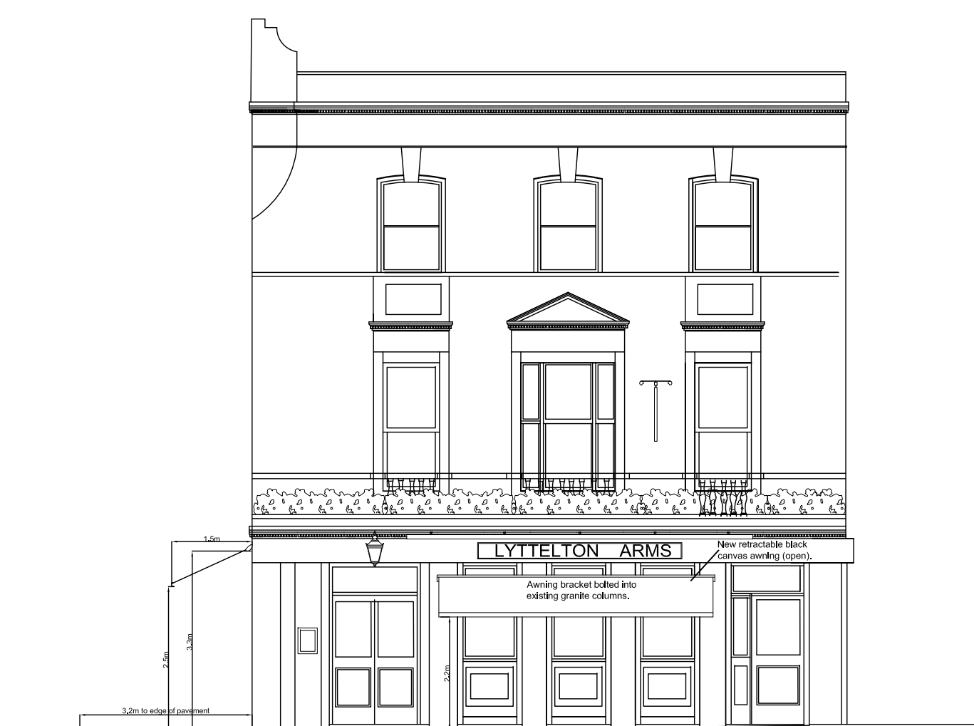
Elevation to Camden High Street (AWNINGS OPEN) Scale 1:100