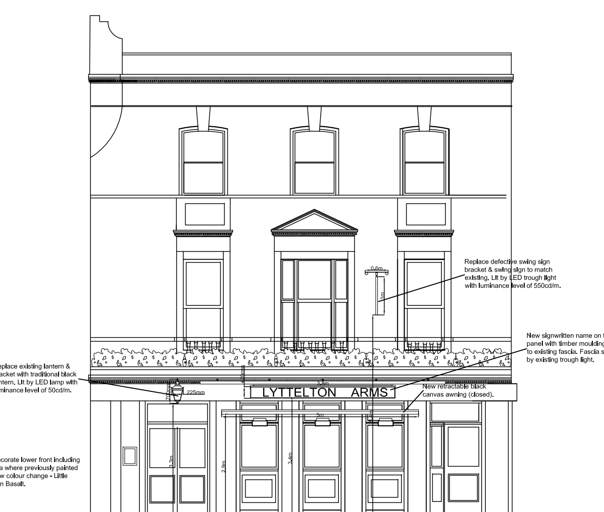
Proposed Elevation to Camden High Street. Scale 1:100