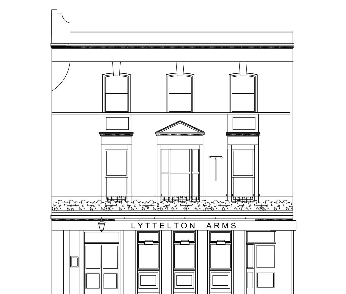
Existing Elevation to Camden High Street. Scale 1:100