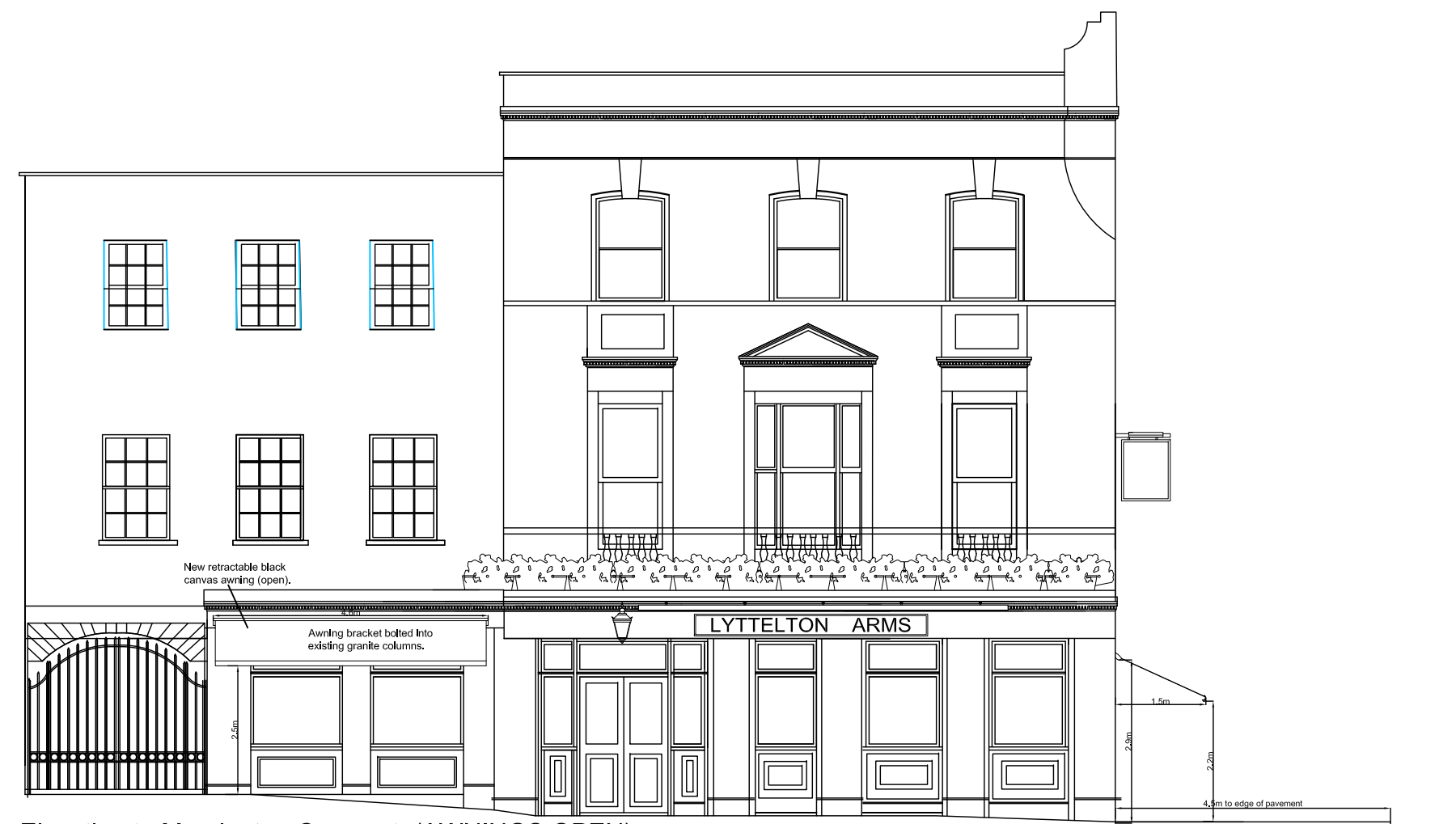
Elevation to Mornington Crescent (AWNINGS OPEN) Scale 1:100

51 - 55 Fowler Road Hainault Essex IG6 3XE Tel : 020 8559 8666 Fax: 020 8559 8777