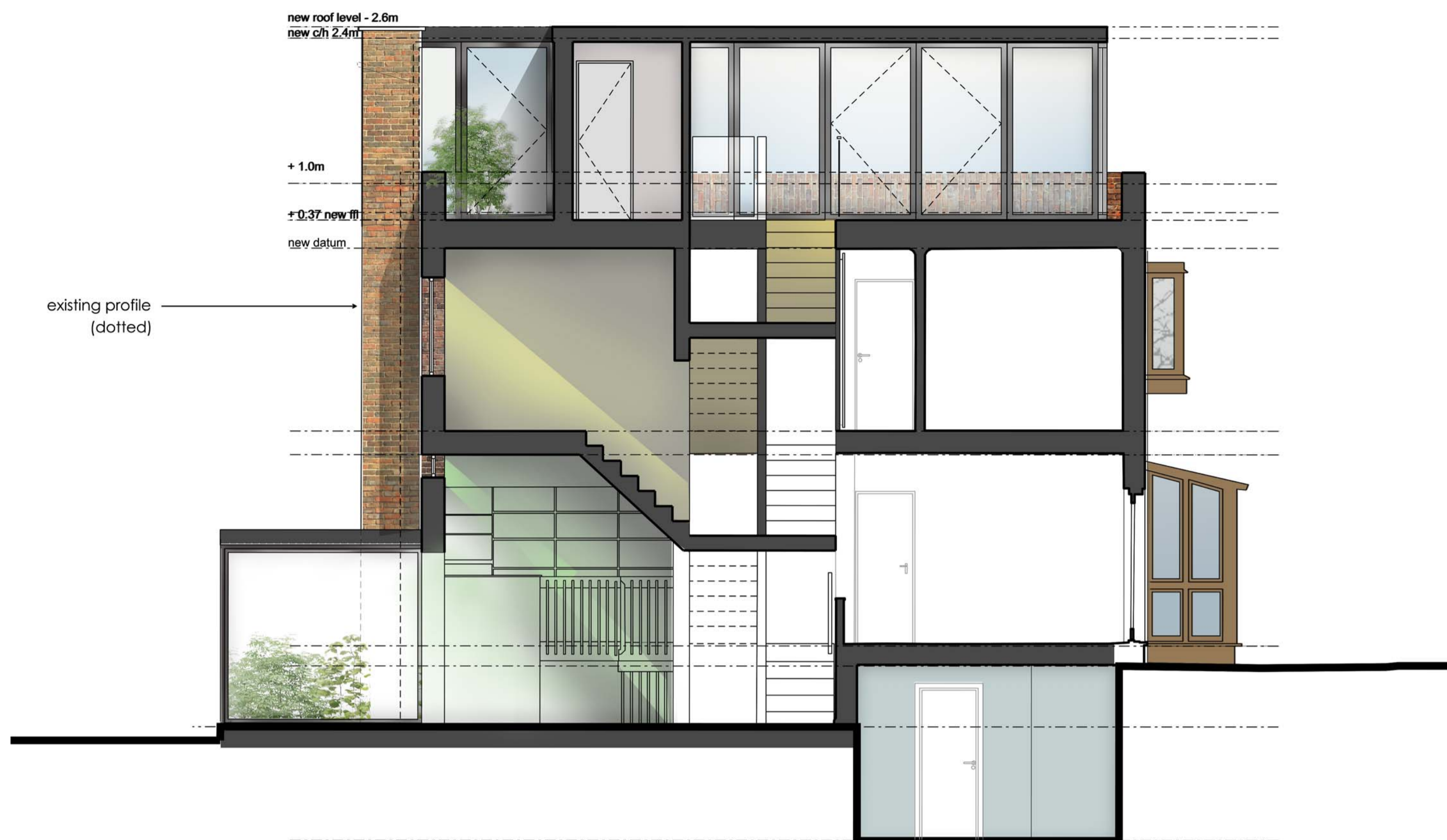
1. SECTION A-A