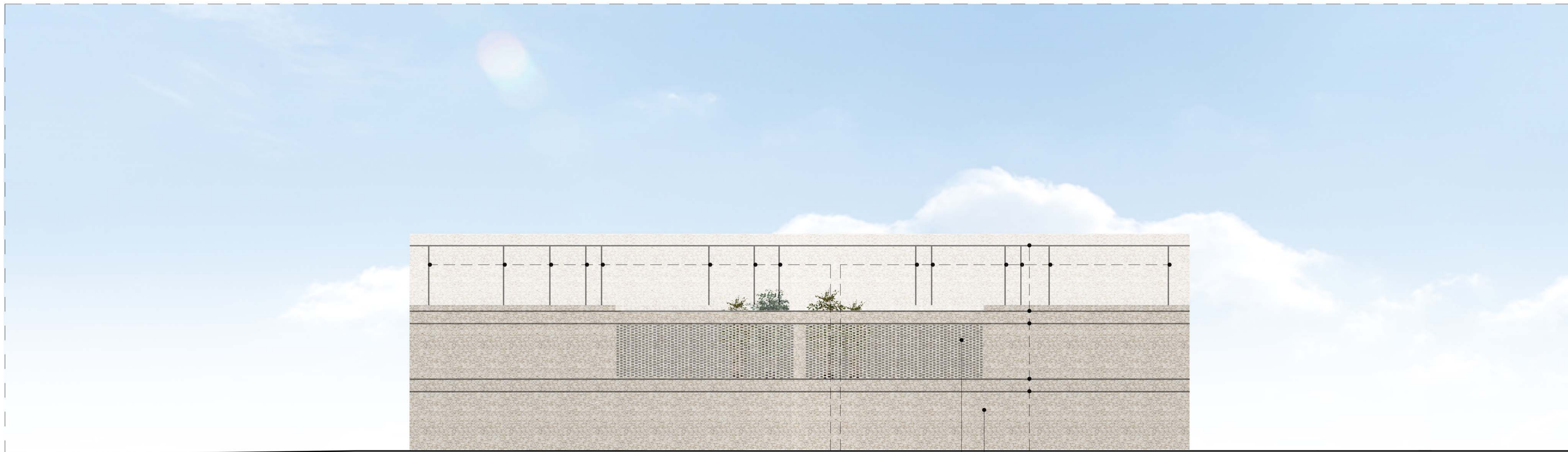
02 South-East Elevation