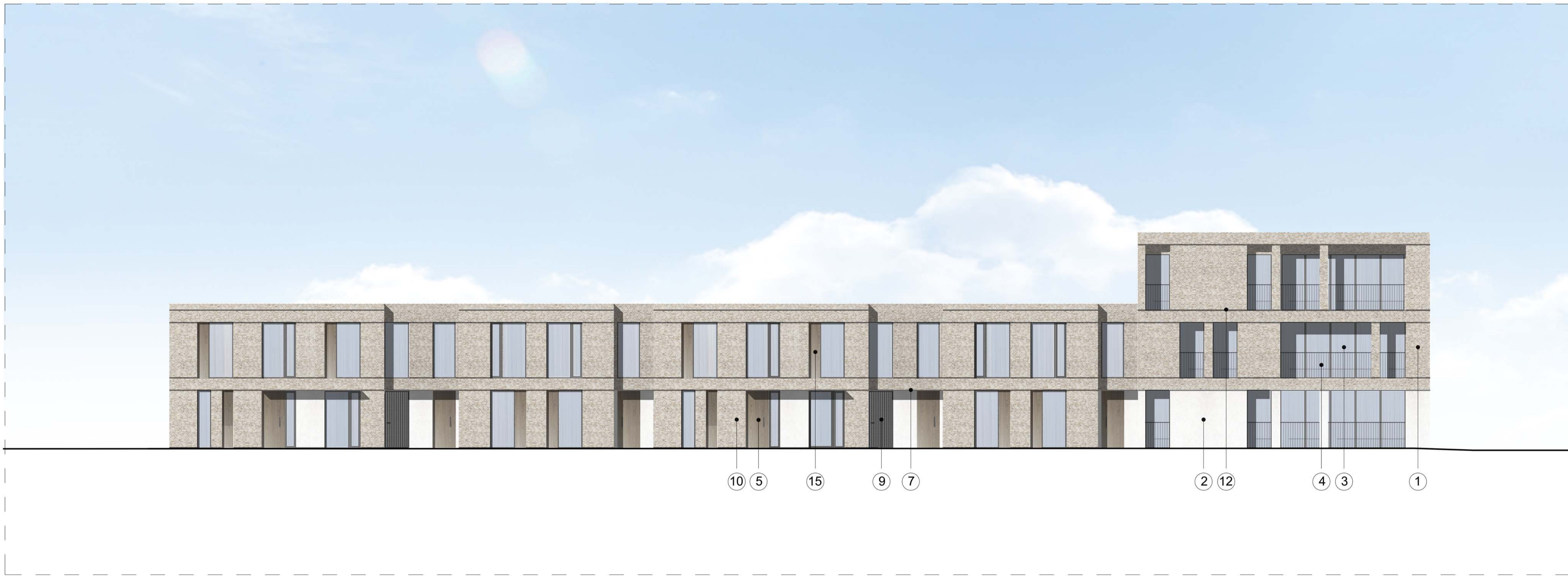
01 North-East Elevation