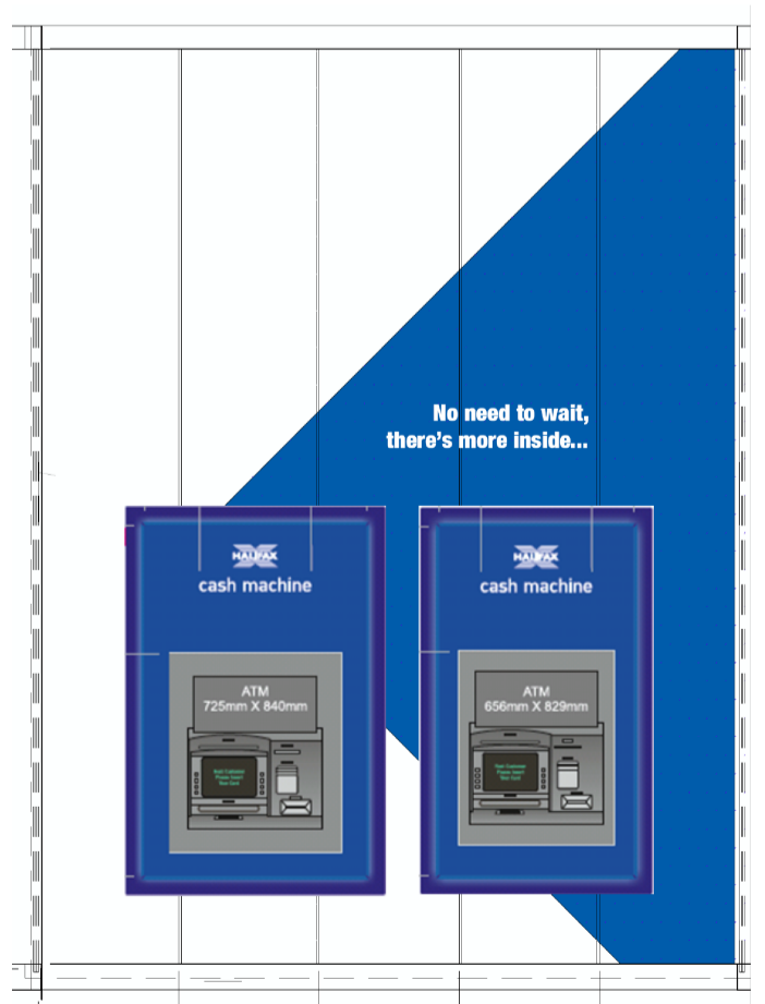
EXAMPLE IMAGE OF PROPOSED ADDITIONAL SIGN