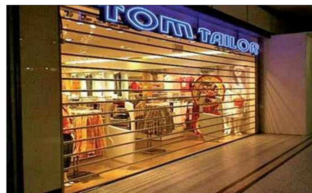
EXAMPLE IMAGE OF PROPOSED SHUTTER Polycarbonate Roller Shutter giving visibility of display areas with an elegant design effect providing excellent physical protection. • Gives maximum visibility of up to 85% • Ensures break-in protection for shop & displays • Smooth surface gives vandals no grip • Impact resistant 6mm thick polycarbonate • Strong solid guides • UV resistant preventing discolouration