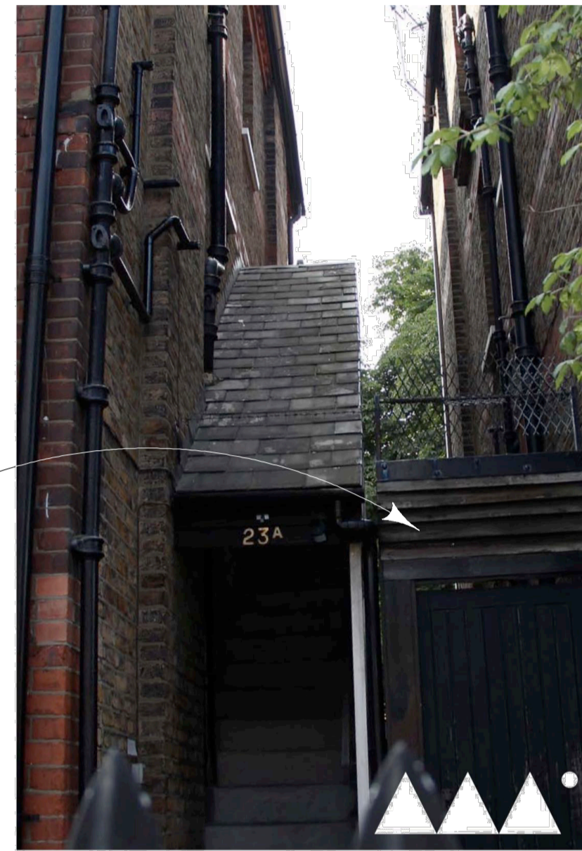
23 Downside Crescent 25 Downside Crescent

existing timber gate and panel to no.25 with security mesh over