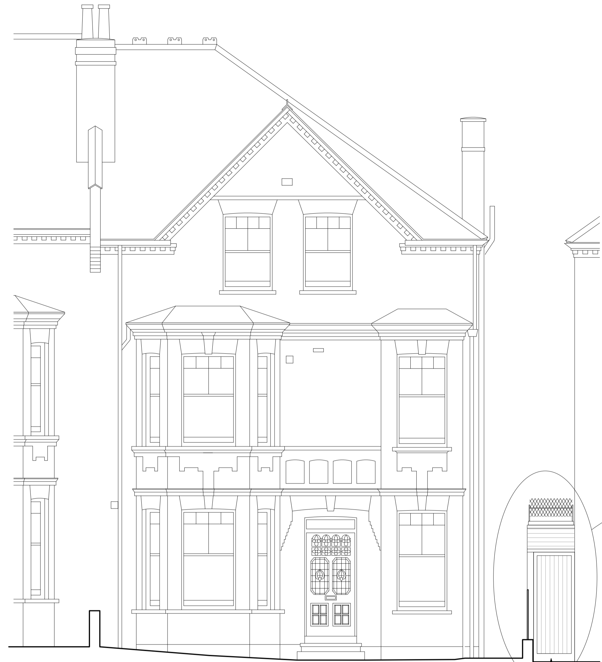
Existing Elevation 1:50

existing timber gate and panel to no.25 with security mesh over