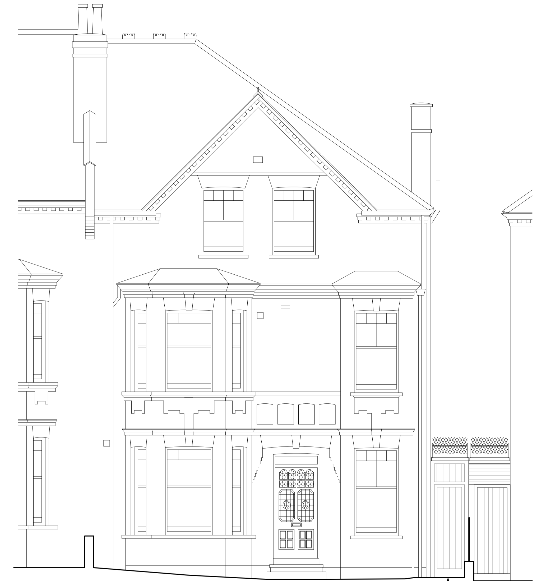
Proposed Elevation 1:50

Photo Note that the stairs (to no."23A") shown in the photo were removed as permitted under application ref 2014/7587/P