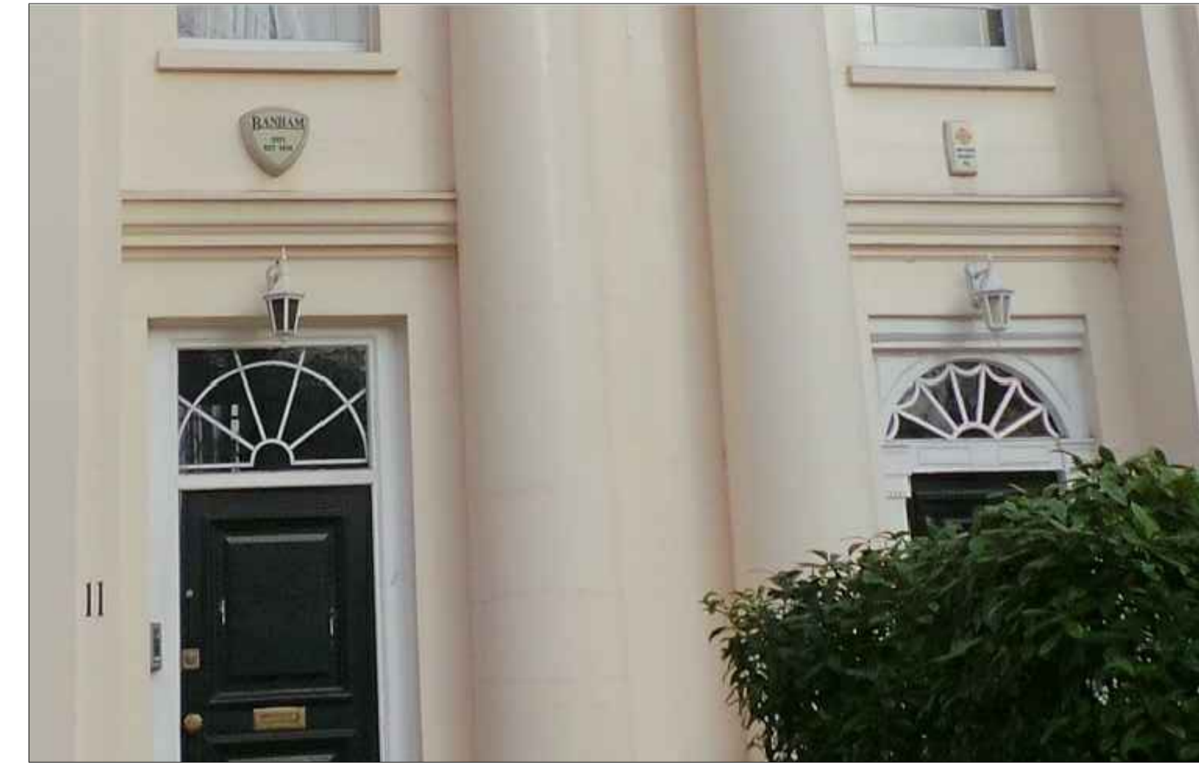
No 11 Existing front doors