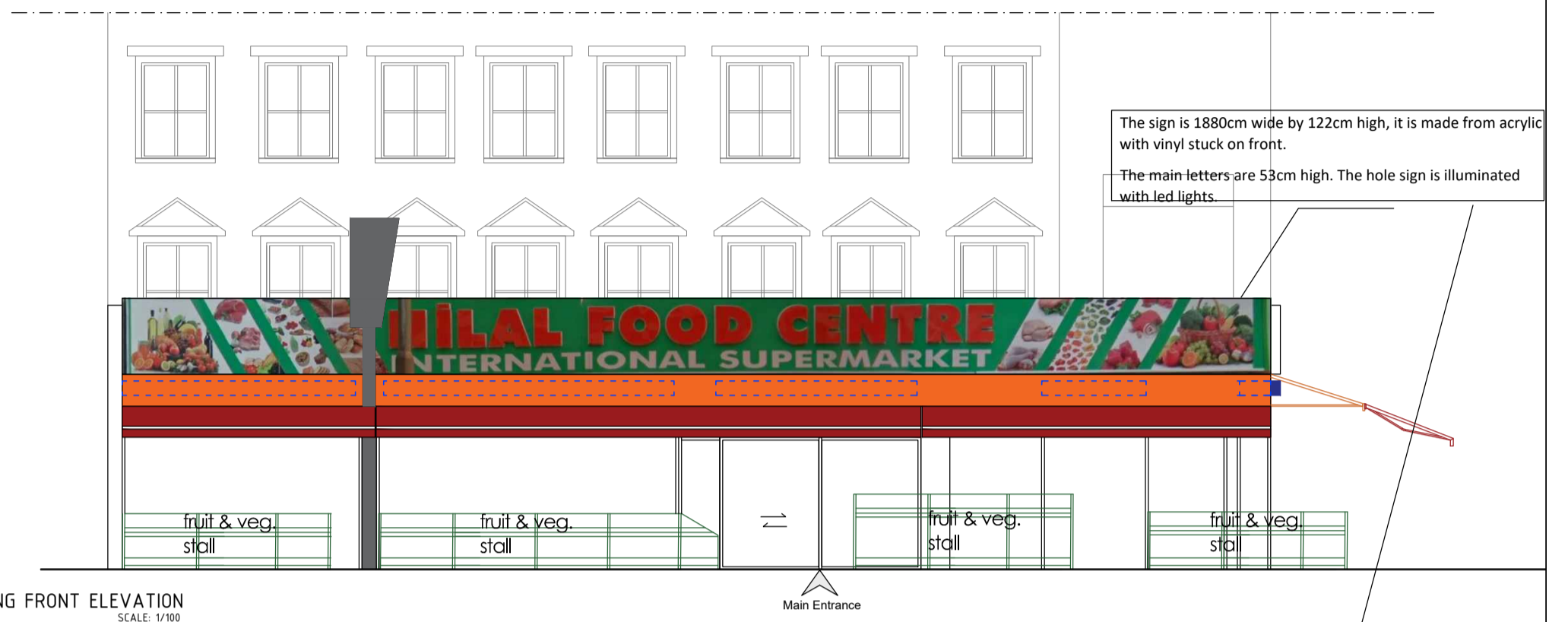
EXISTING FRONT ELEVATION SCALE: 1/100