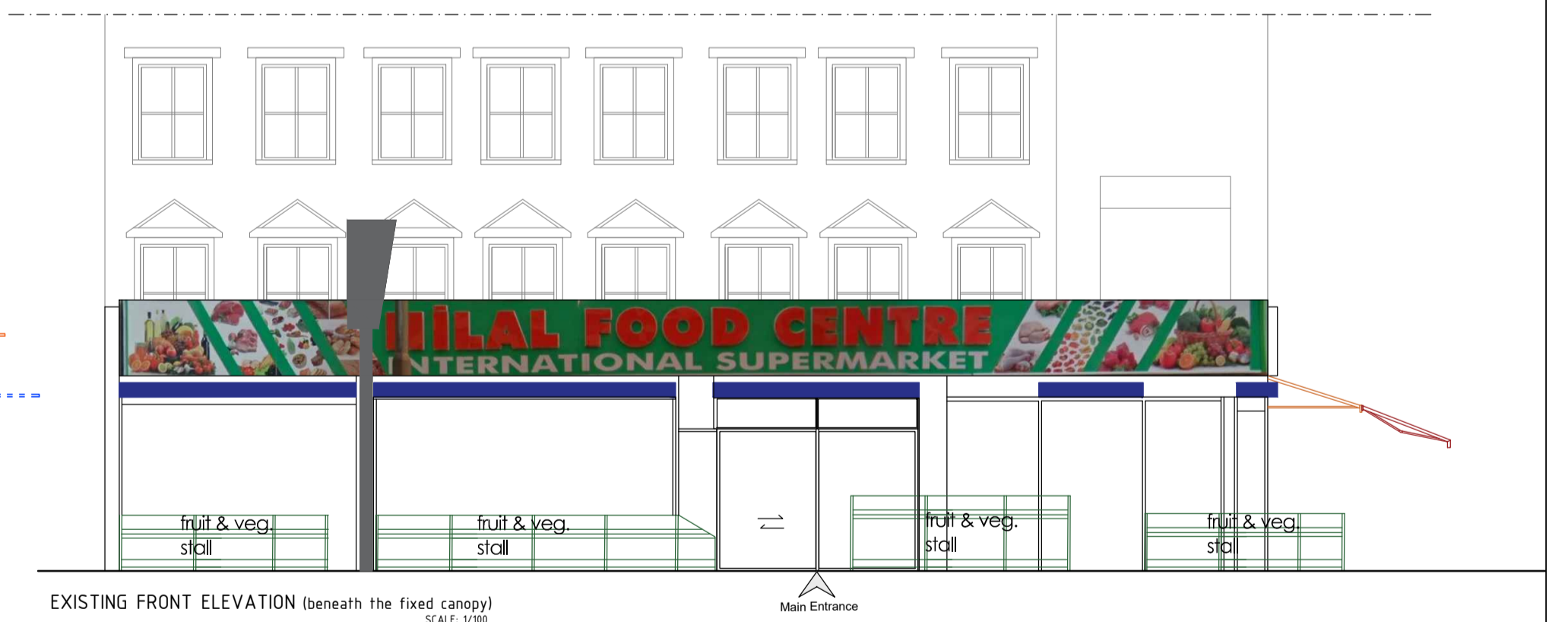
EXISTING FRONT ELEVATION (beneath the fixed canopy) SCALE: 1/100