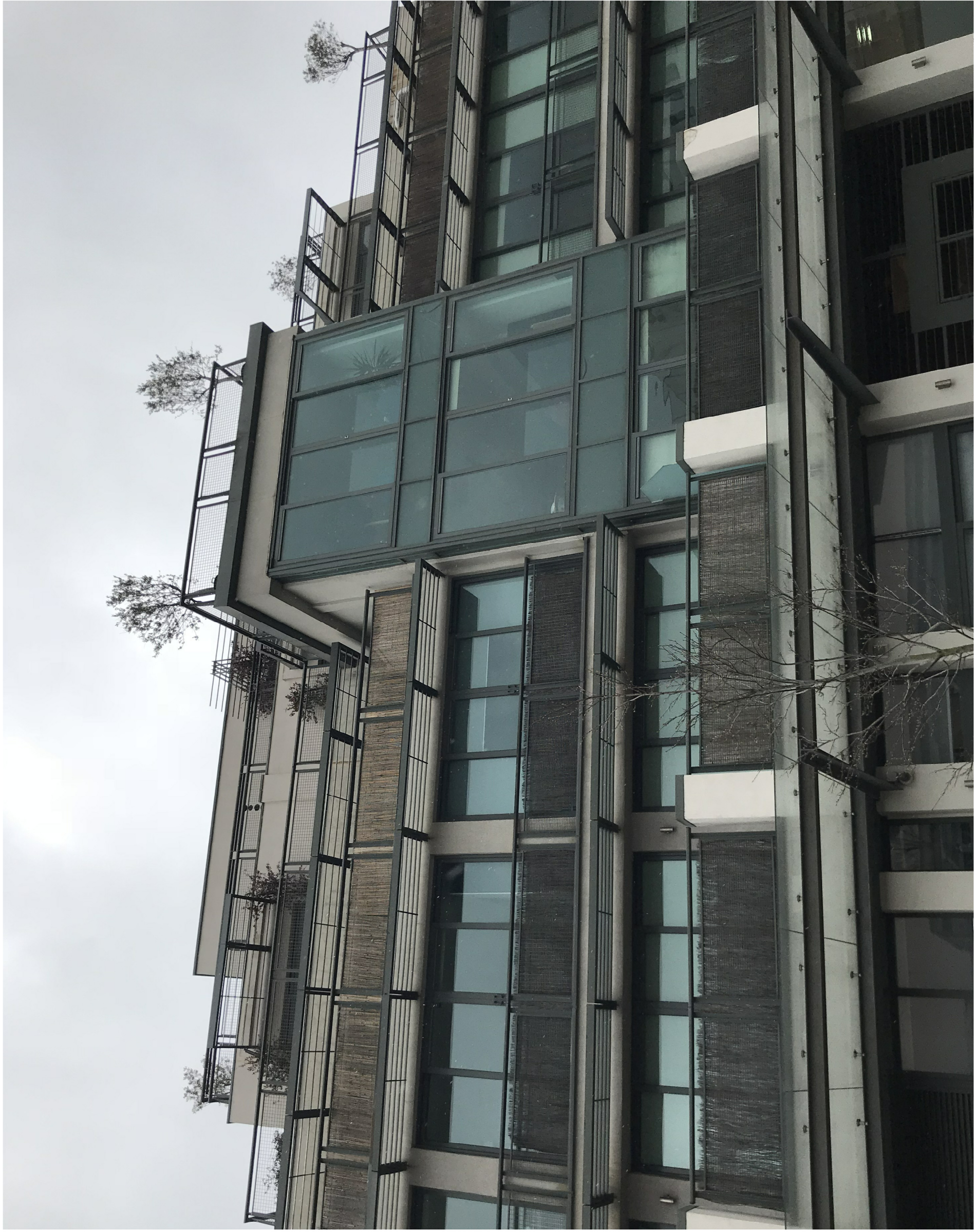
EXISTING VIEW 4