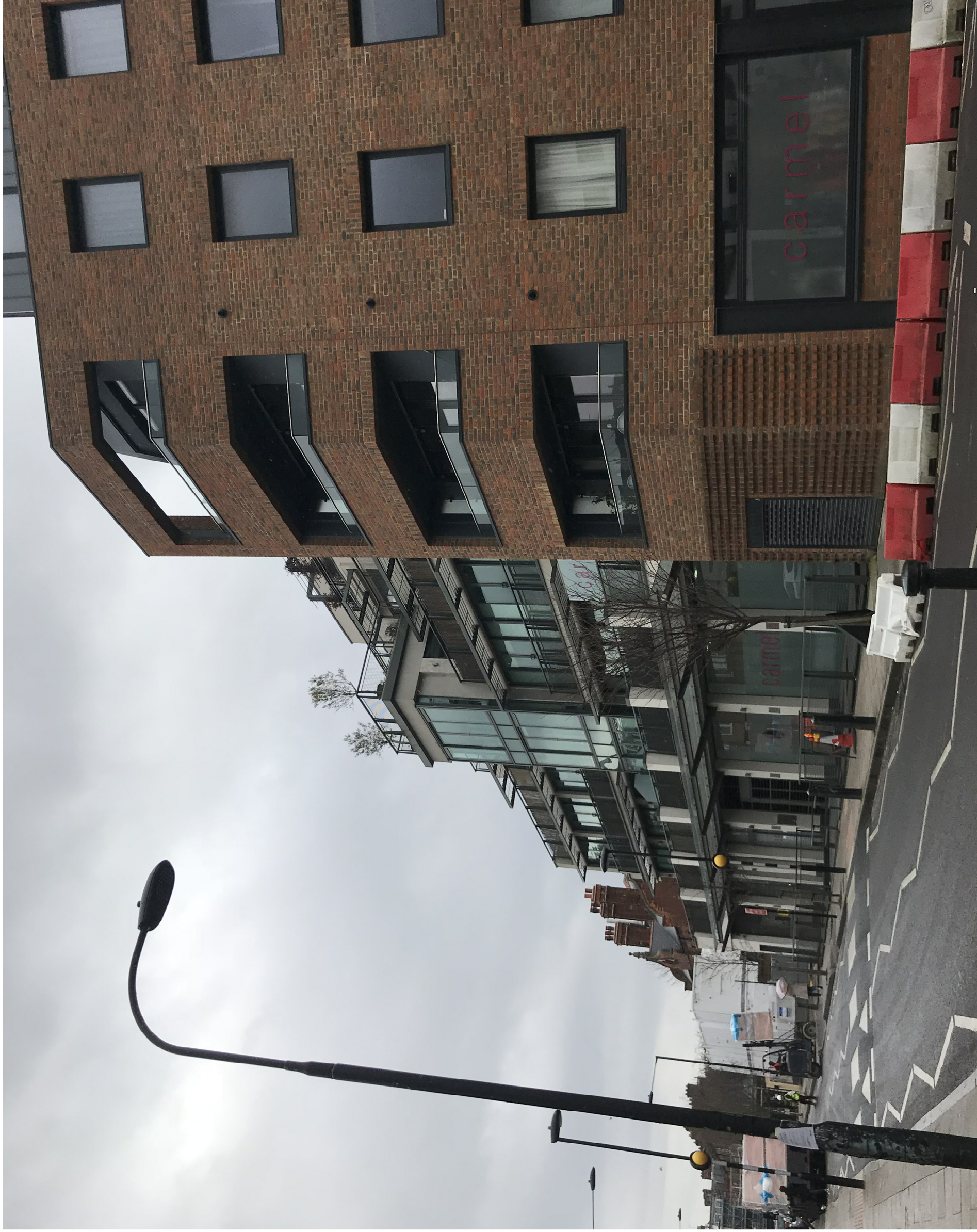
EXISTING VIEW 3