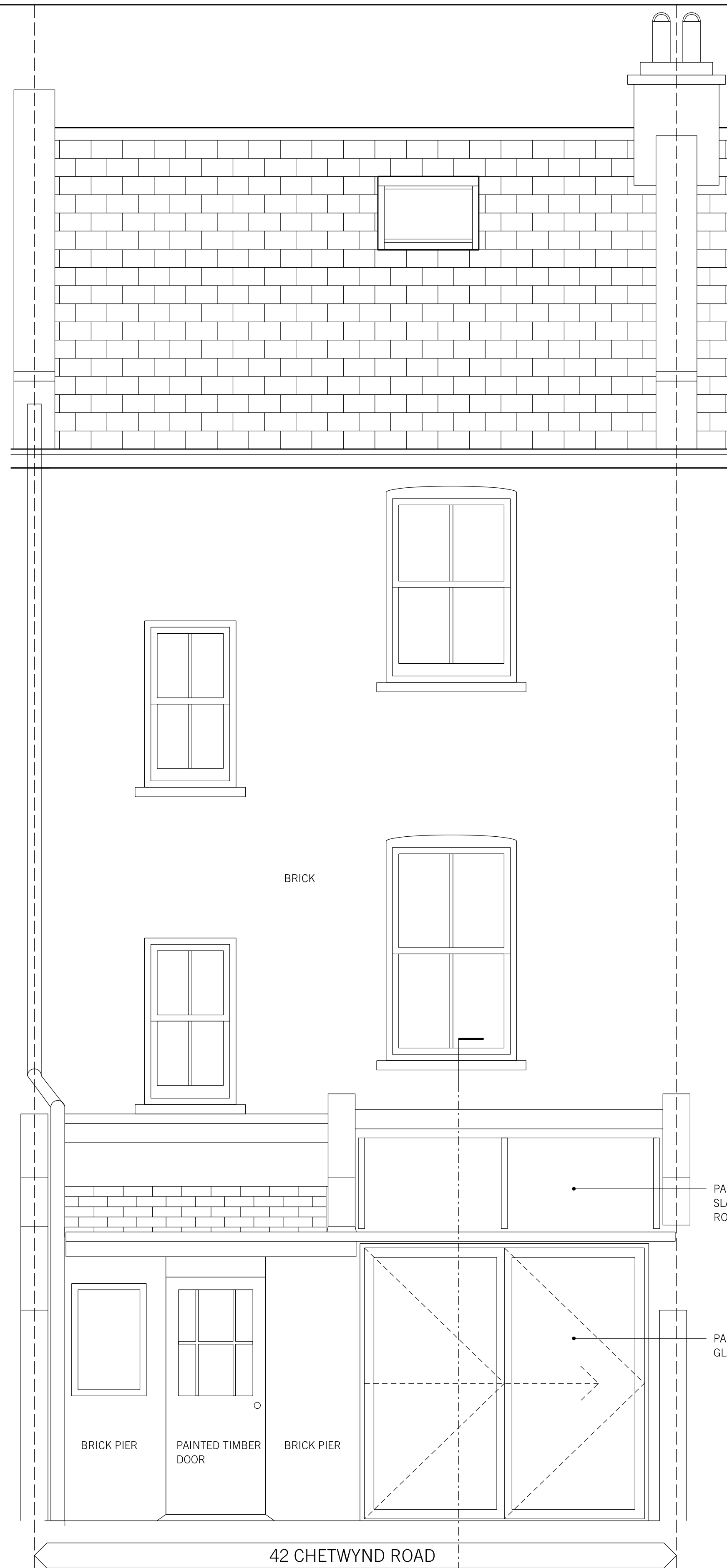
01: PROPOSED SOUTH ELEVATION SCALE 1:25