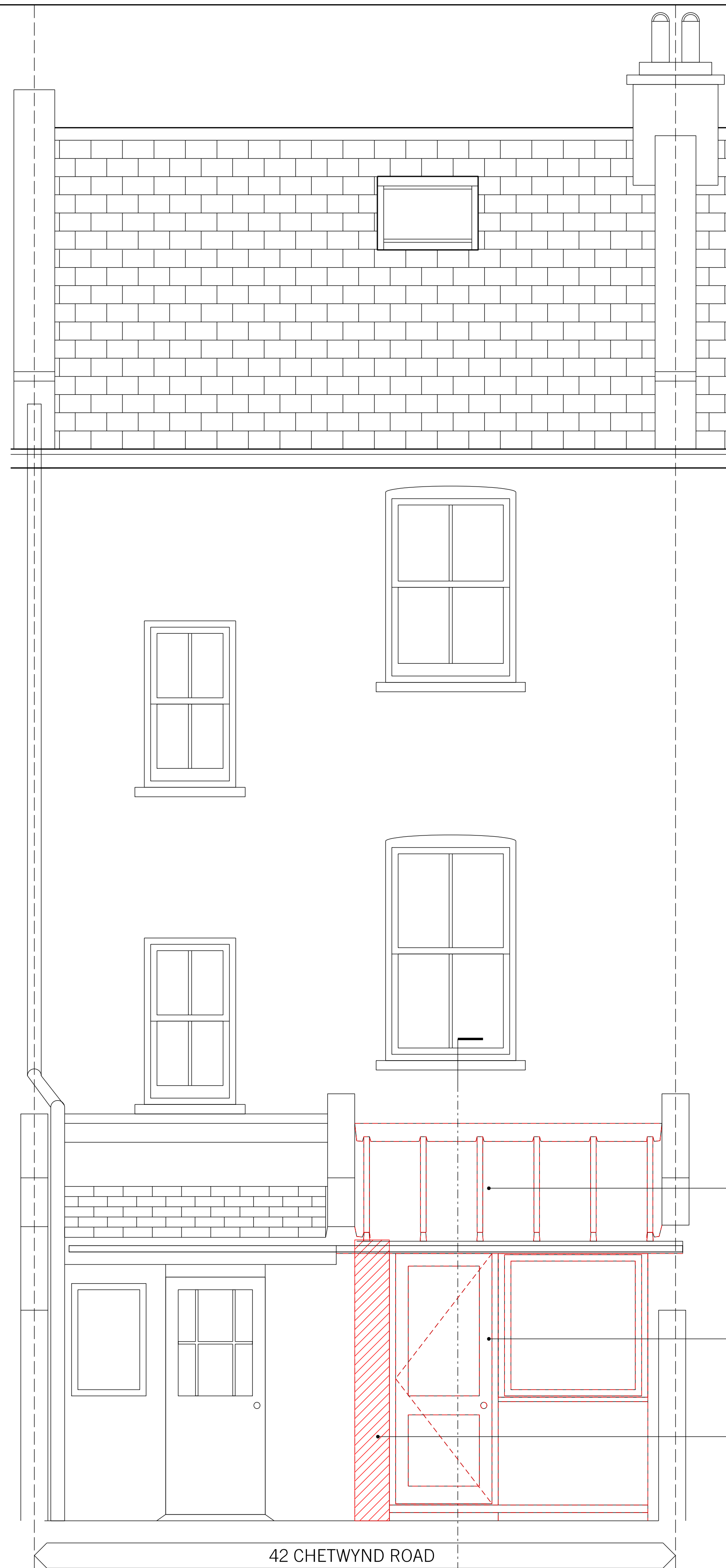
01: EXISTING DEMOLITION SOUTH ELEVATION SCALE 1:25