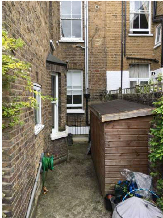
REAR SIDE GARDEN