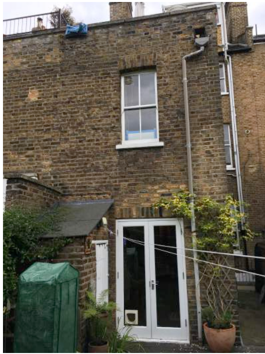
REAR ELEVATION & EXISTING LEAN TO EXTENSION