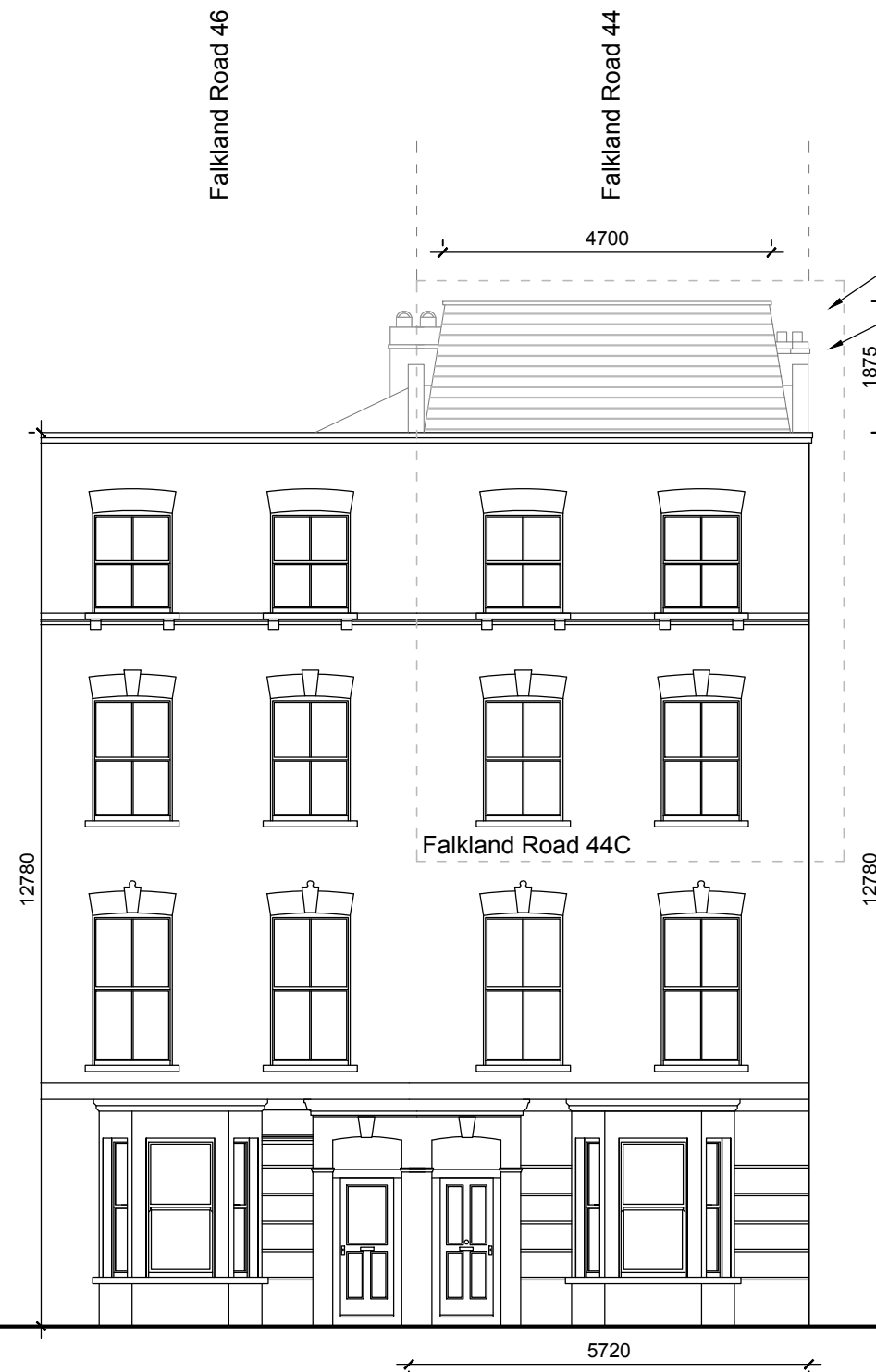
DESIGN PROPOSAL_FRONT ELEVATION 44 FALKLAND ROAD

mansard roof conversion preservation original chimneys brickwork original facade untouched