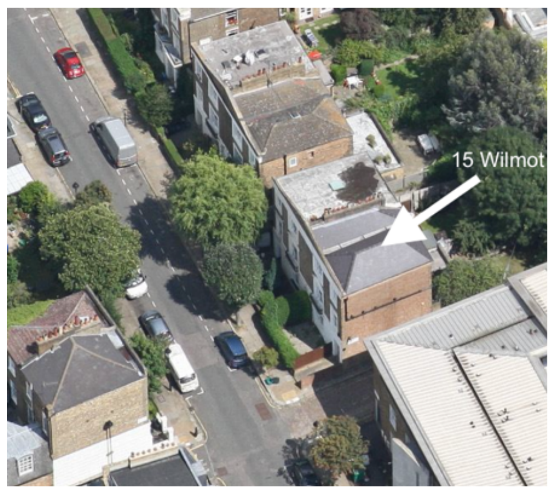
Aerial photograph showing side elevation