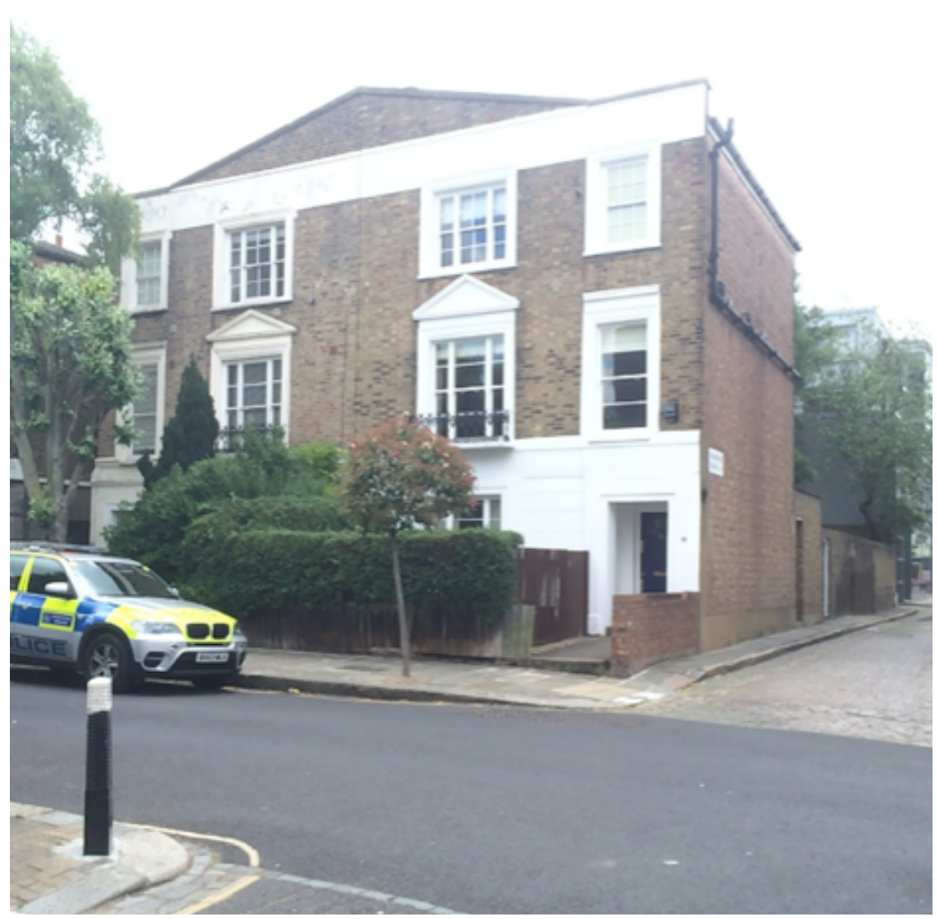
Front view of No. 15 Wilmot Place