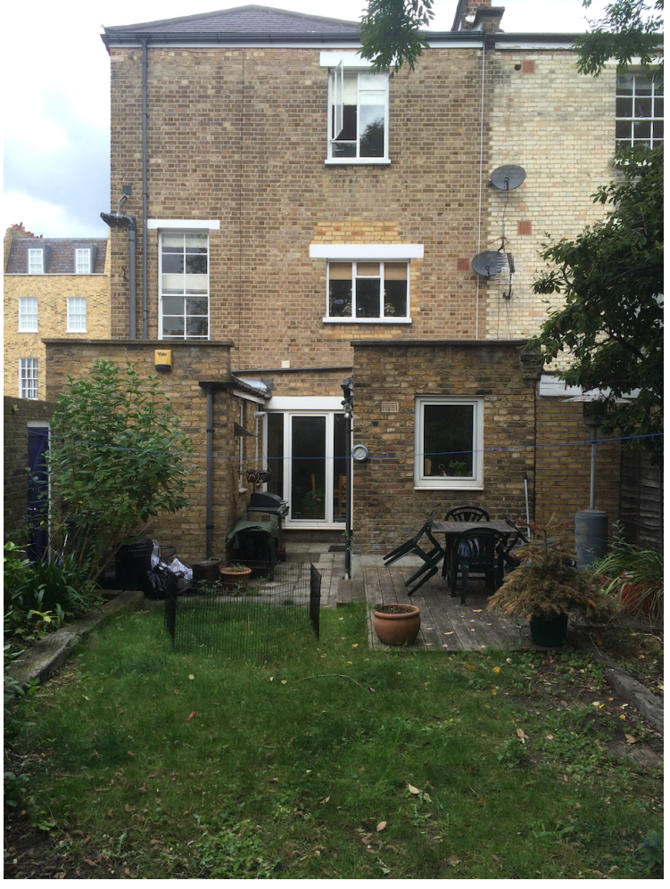
Rear view of No. 15 Wilmot Place

The proposed single storey extension will have no impact on the amenity of the neighbouring