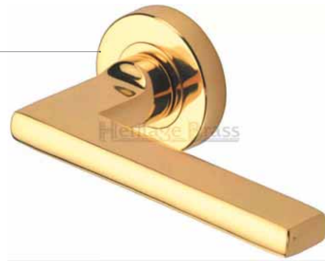
04 PROPOSED DOOR HANDLE

POLISHED BRASS 'TRIDENT' LEVER DOOR HANDLE ON POLISHED BRASS ROSE. MANUFACTURER: WAYFAIR