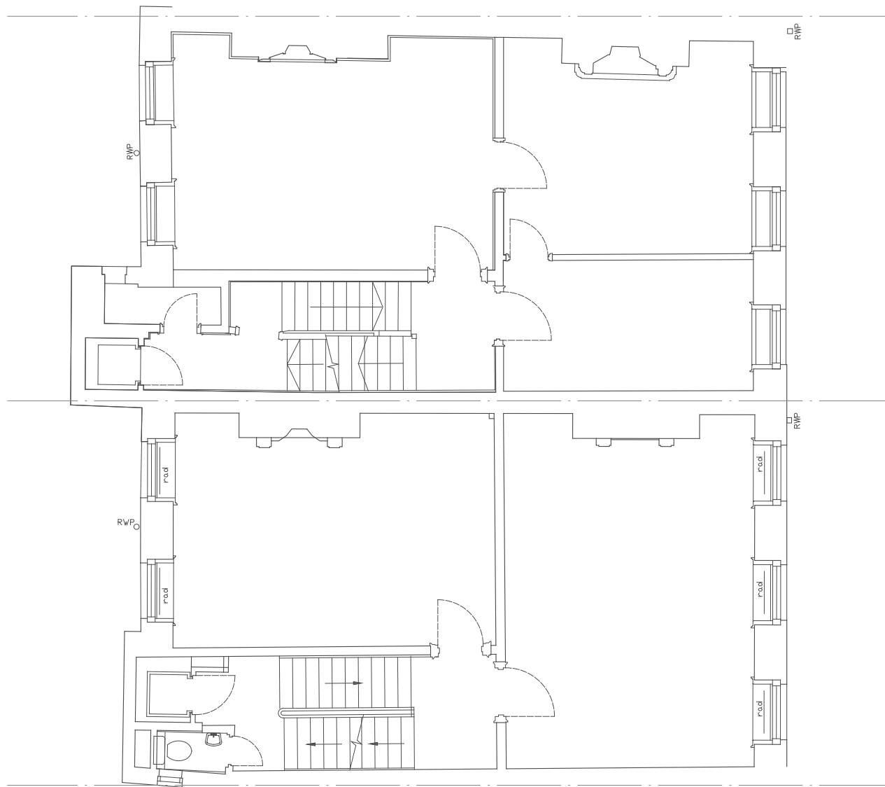
01 EXISTING FIRST FLOOR PLAN SCALE 1:50@A1

This drawing is copyright. All rights reserved. Do not scale from this drawing; work from figured dimensions only.