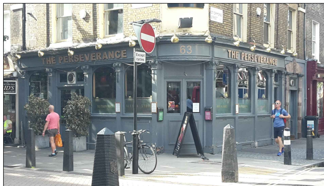
External existing photograph