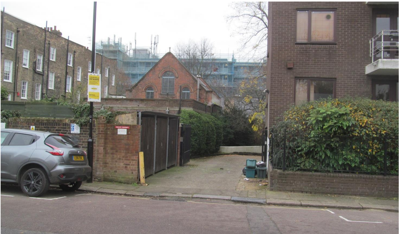
Photo 2 Rear of Temple and adjacent access to Julian Court basement car park Note 1 Parking Bay to rear of temple is a disabled bay.