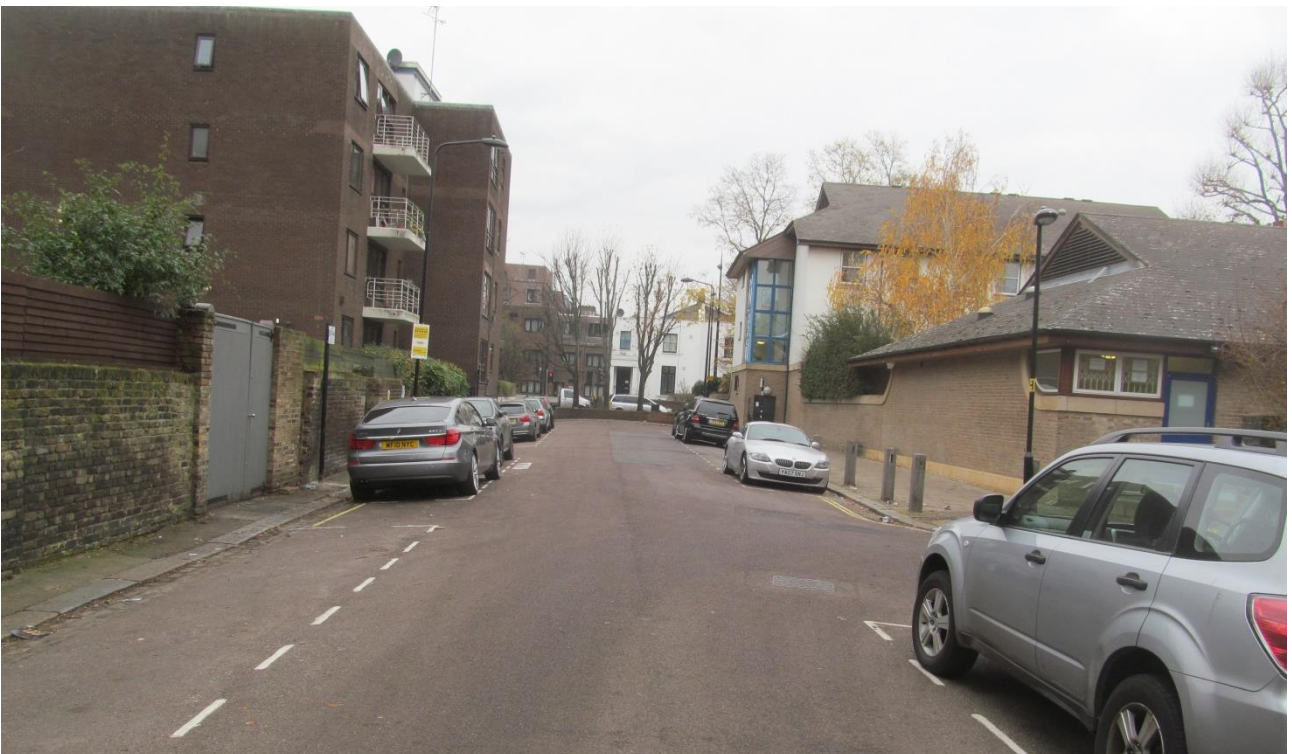
Photo 4 Junction of Rochester Square East and Camden Road blocked to vehicles with raised planter Note 1 Grey doors to rear garden of house to south of temple and Camden Mews to other side of road