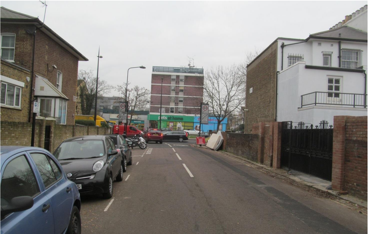
Photo 3 No restrictions at junction of Rochester Square West and A503, Camden Road. Note 1 Right hand turning lane on Camden Road.