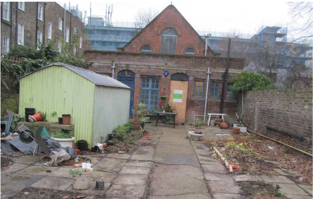
Photo 6 Temple rear yard and single storey offices with flat roof. [Offices to be demolished]