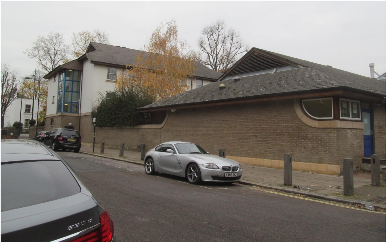
Photo 5 Parking bay on opposite side of Rochester Square East which will need to be partially suspended for wagon movements onto the site