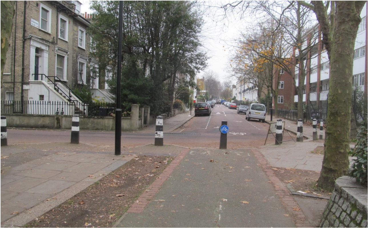
Photo 7 Cycle route as junction of Rochester Square West [to left] and Stratford Villas [straight ahead]