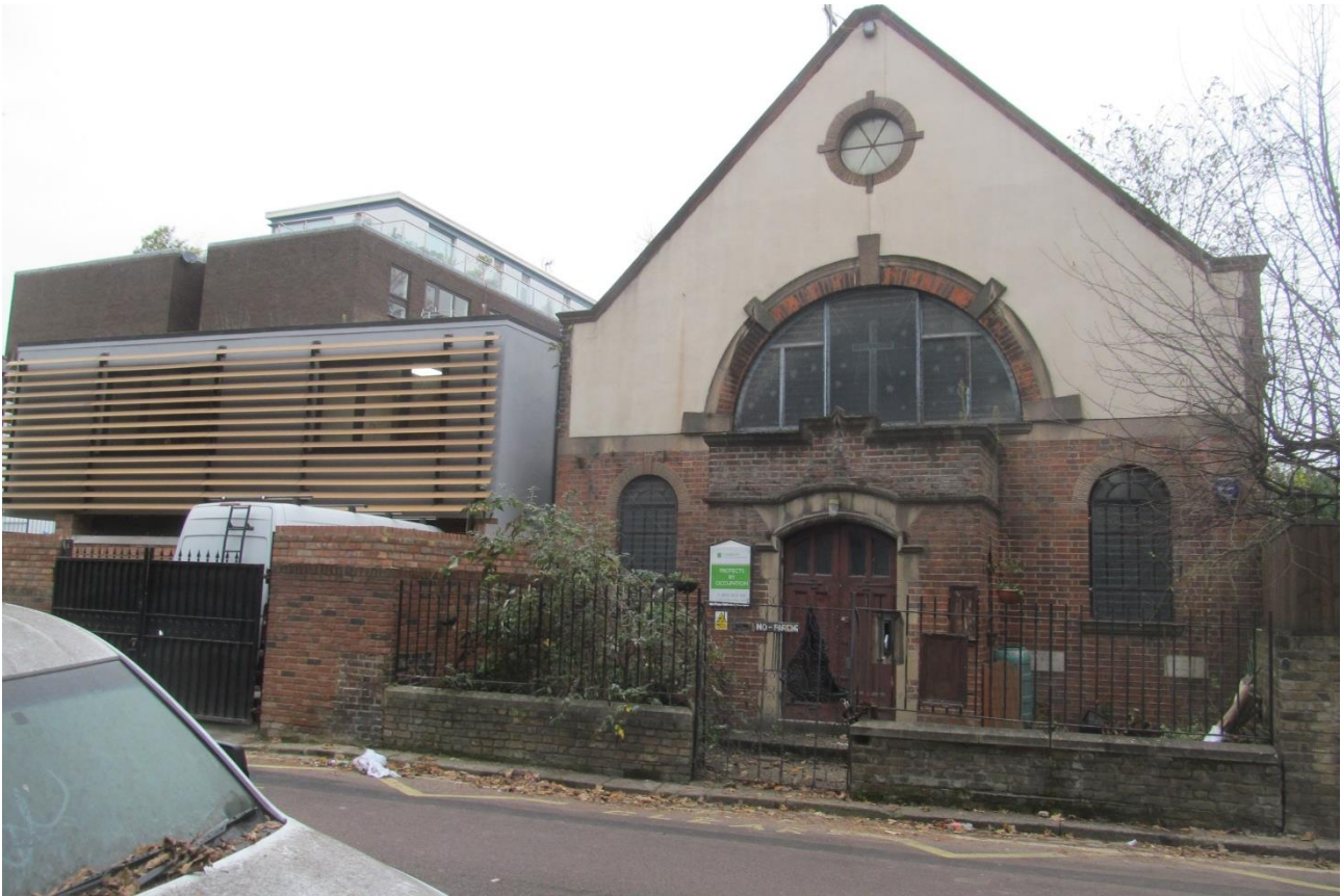
Photo 1 Entrance to Temple on Rochester Square West with Studio to the north Note 1 No pavement and zig-zags outside temple.