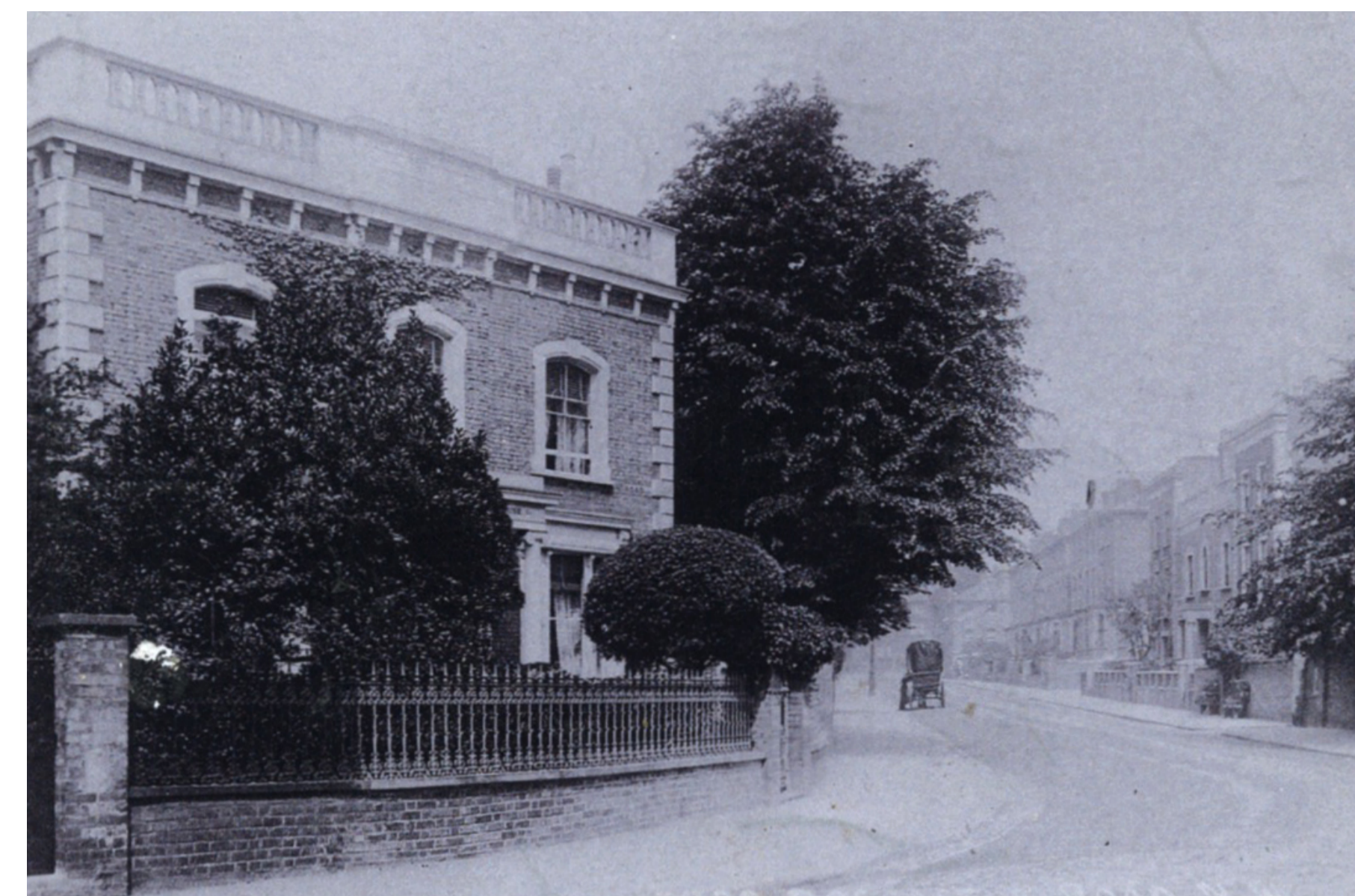
Historical photo of 1 Boscastle Road showing the original raised parapet wall detail