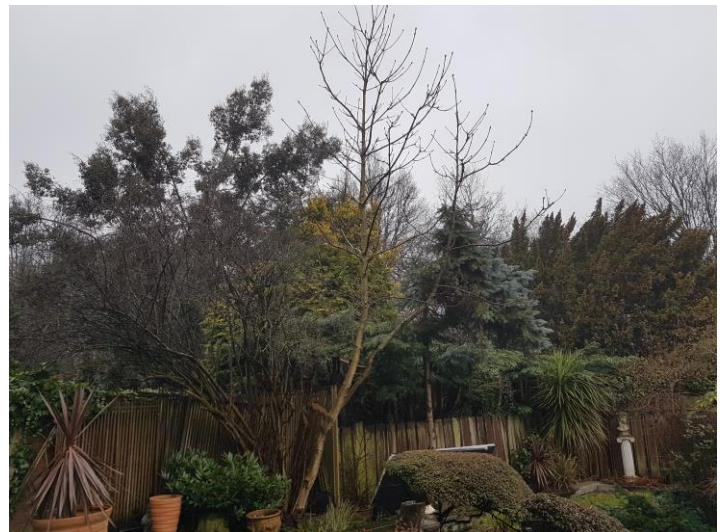
Showing T6 & T7