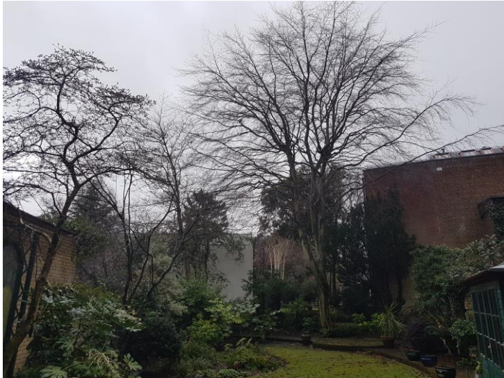
Showing T1 – T4