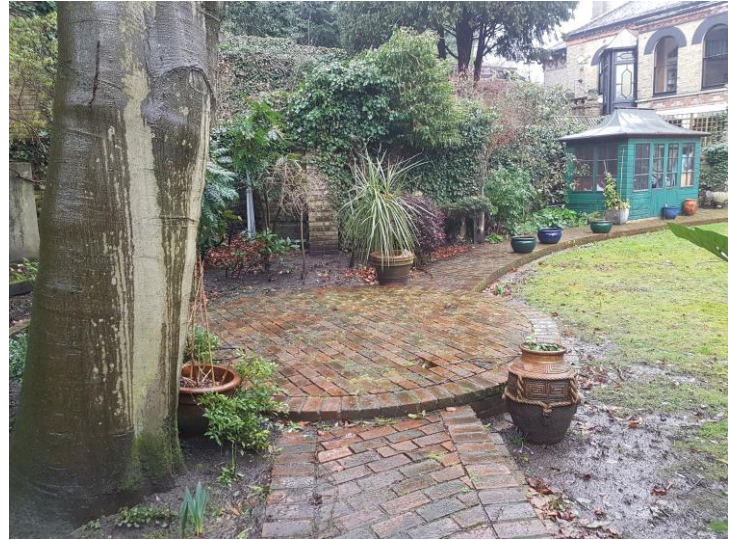
Showing existing path adjacent to T1