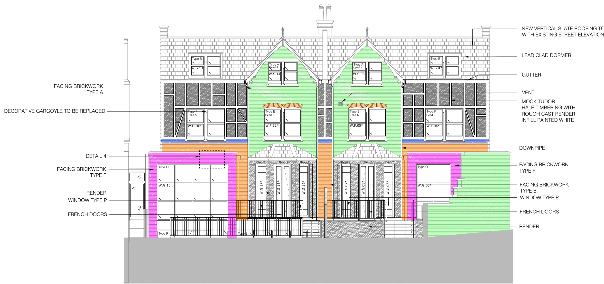
Rear Elevation (C) Scale 1:100