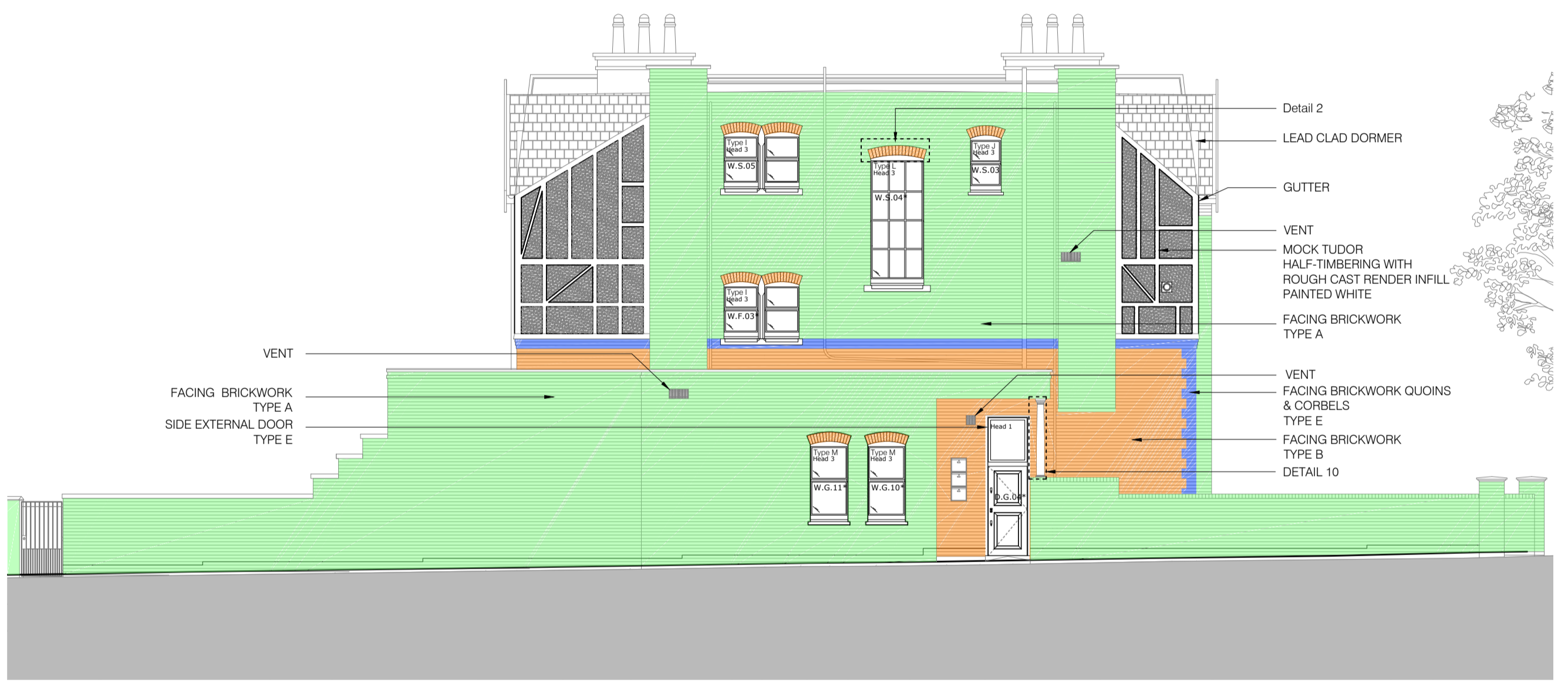
West Side Elevation (B) Scale 1:100