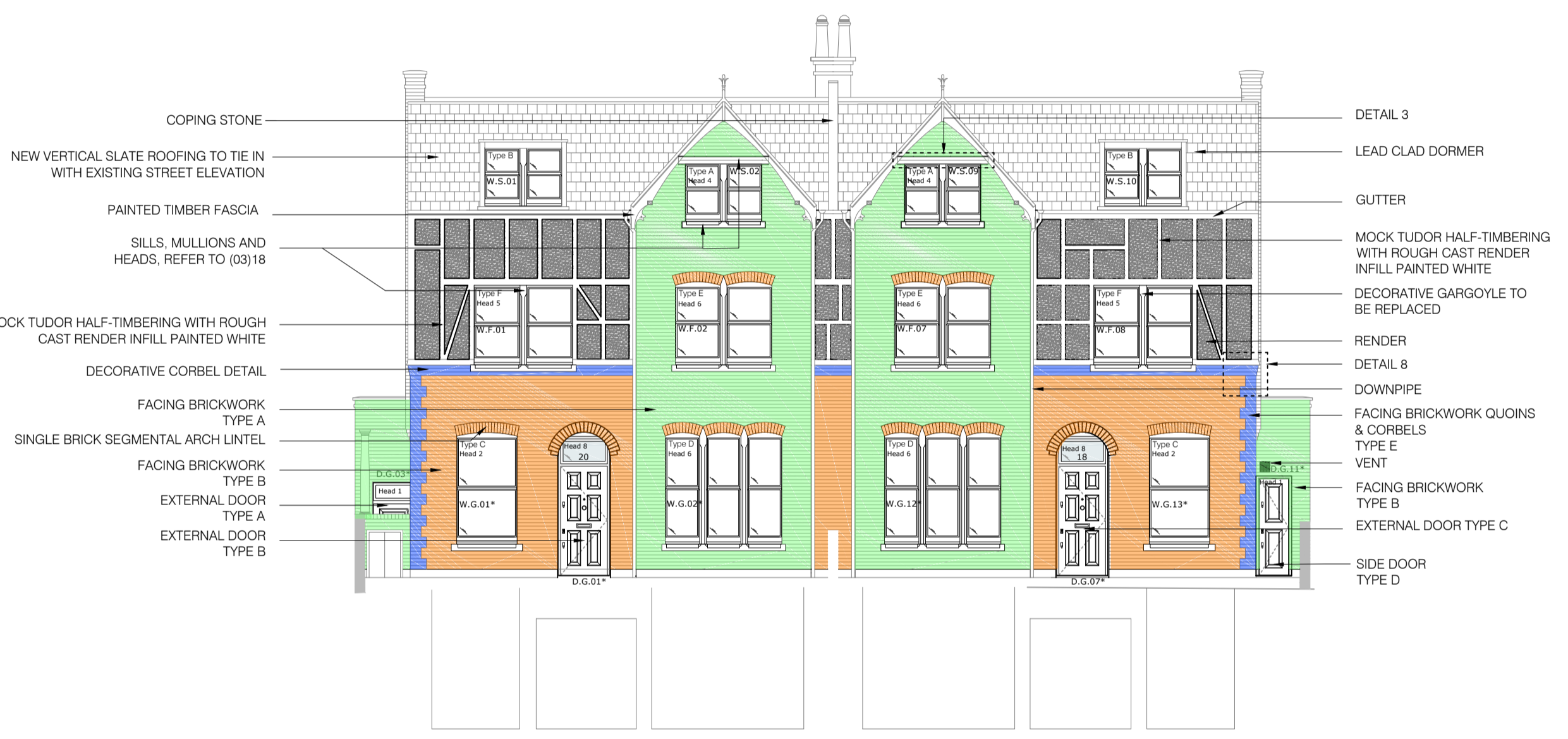
Front Elevation (A) Scale 1:100

This contract shall include all dimensions, levels and materials specified in the contract documents. The contractor shall be responsible for ensuring that all work is carried out in accordance with the contract documents. The contractor shall be responsible for obtaining all necessary permissions and approvals. The contractor shall be responsible for the safety of all workers and the public. The contractor shall be responsible for the protection of all existing structures and services. The contractor shall be responsible for the removal of all waste and debris. The contractor shall be responsible for the reinstatement of all structures and services. The contractor shall be responsible for the completion of all work within the agreed programme of works.