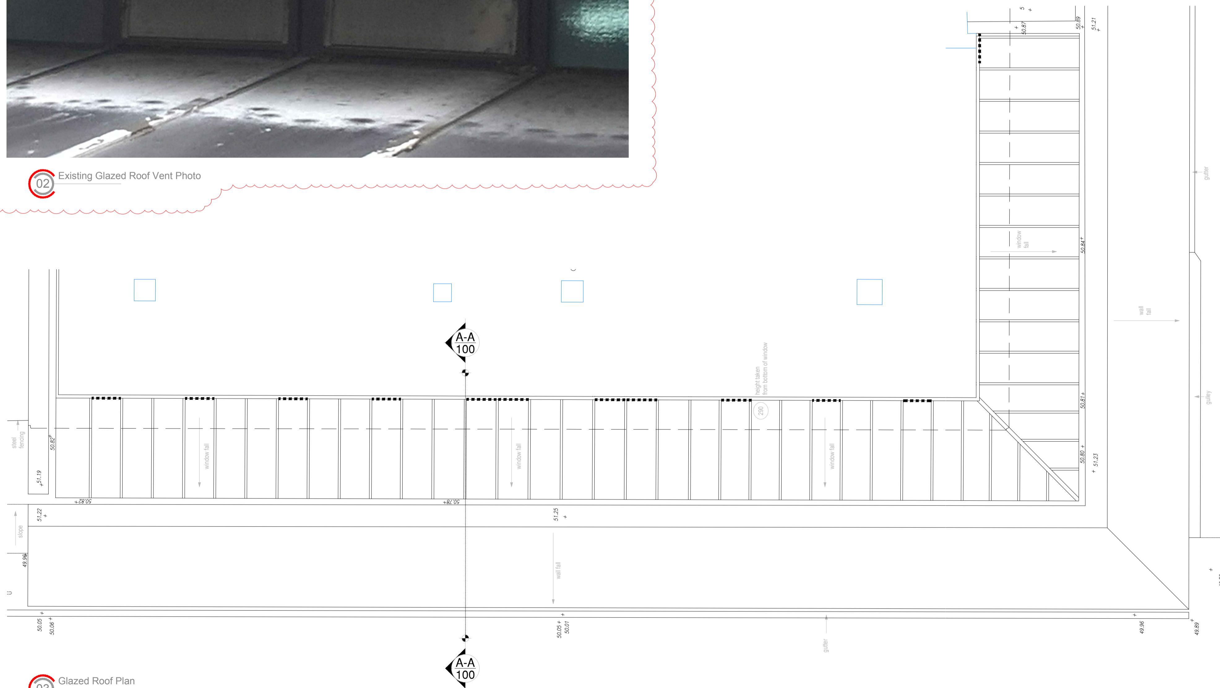
03 Glazed Roof Plan Scale 1:50