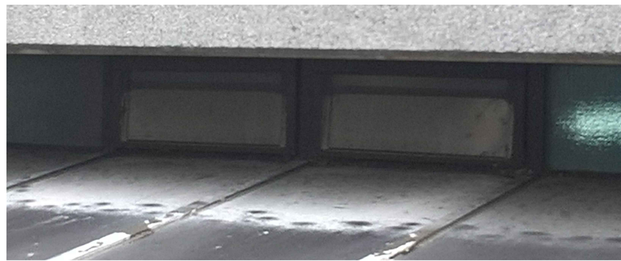
02 Existing Glazed Roof Vent Photo