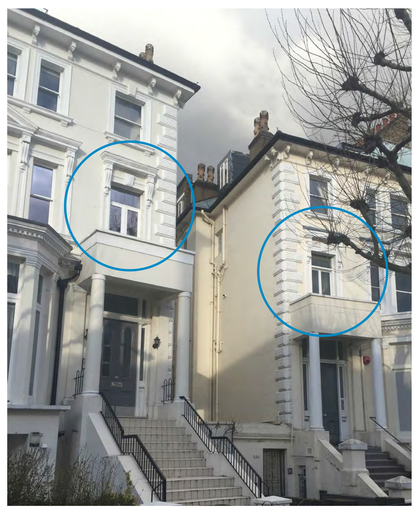
Examples of existing french doors and fixed panel above (matching our proposal) found in close proximity of the site: No. 52 & 54 Belsize Park Gardens.