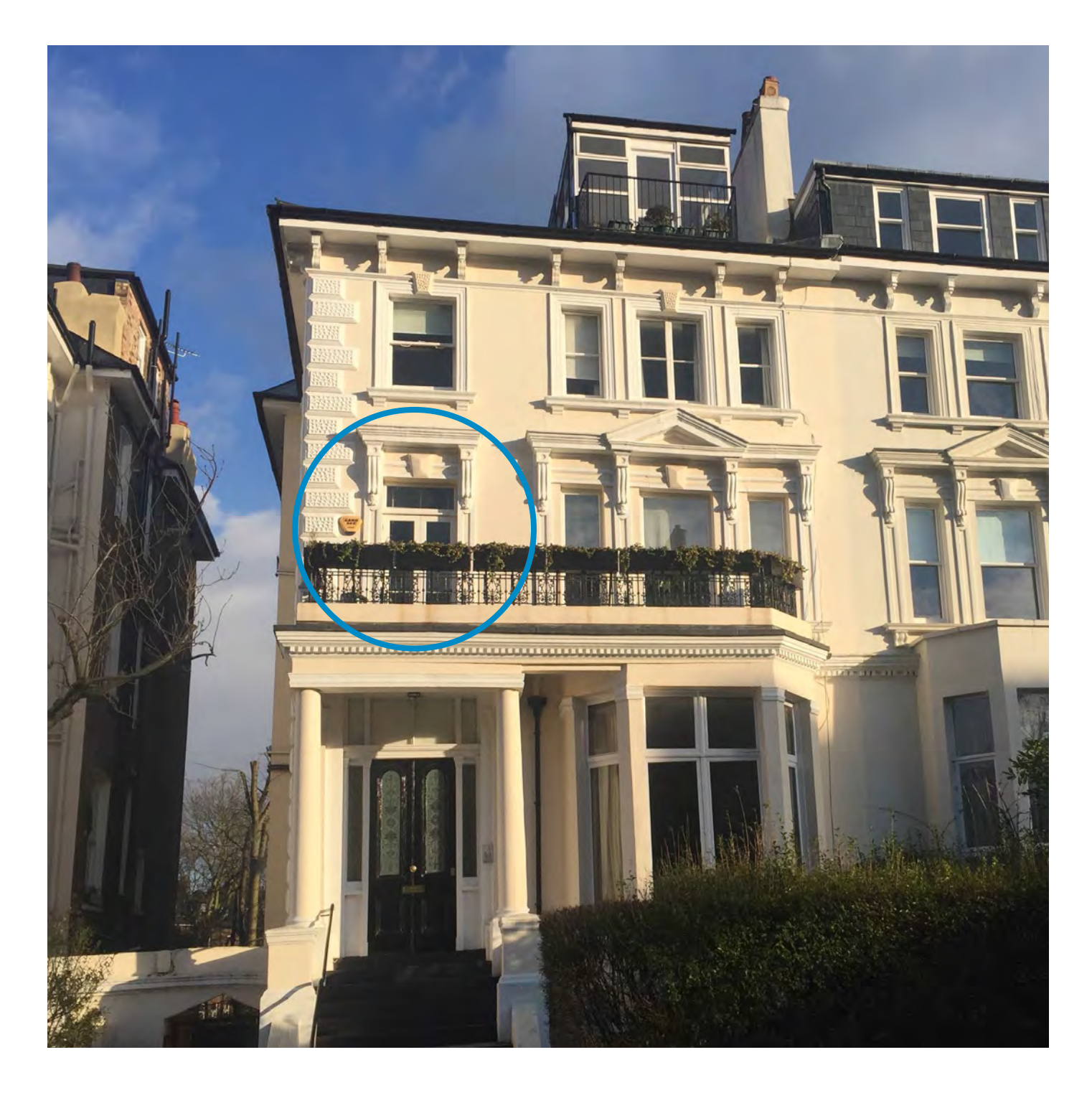
Examples of existing french doors and fixed panel above (matching our proposal) found in close proximity of the site: No. 4 Belsize Grove. Here the balcony is also extended.