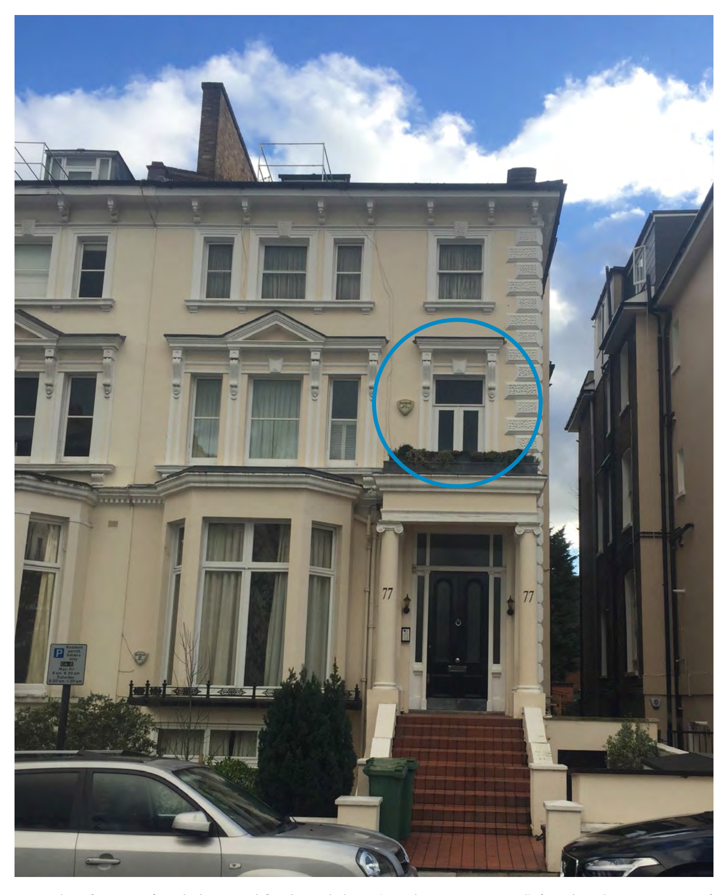
Examples of existing french doors and fixed panel above (matching our proposal) found in close proximity of the site: No. 77 Belsize Park Gardens.