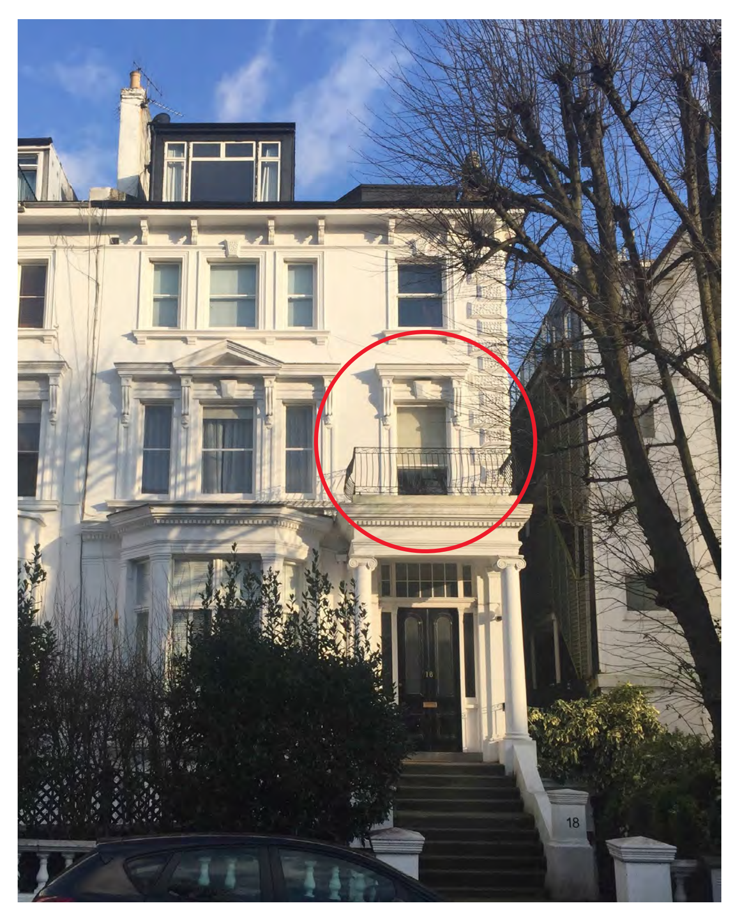
18 Belsize Grove: view of the existing sash window exit to existing balcony from outside.