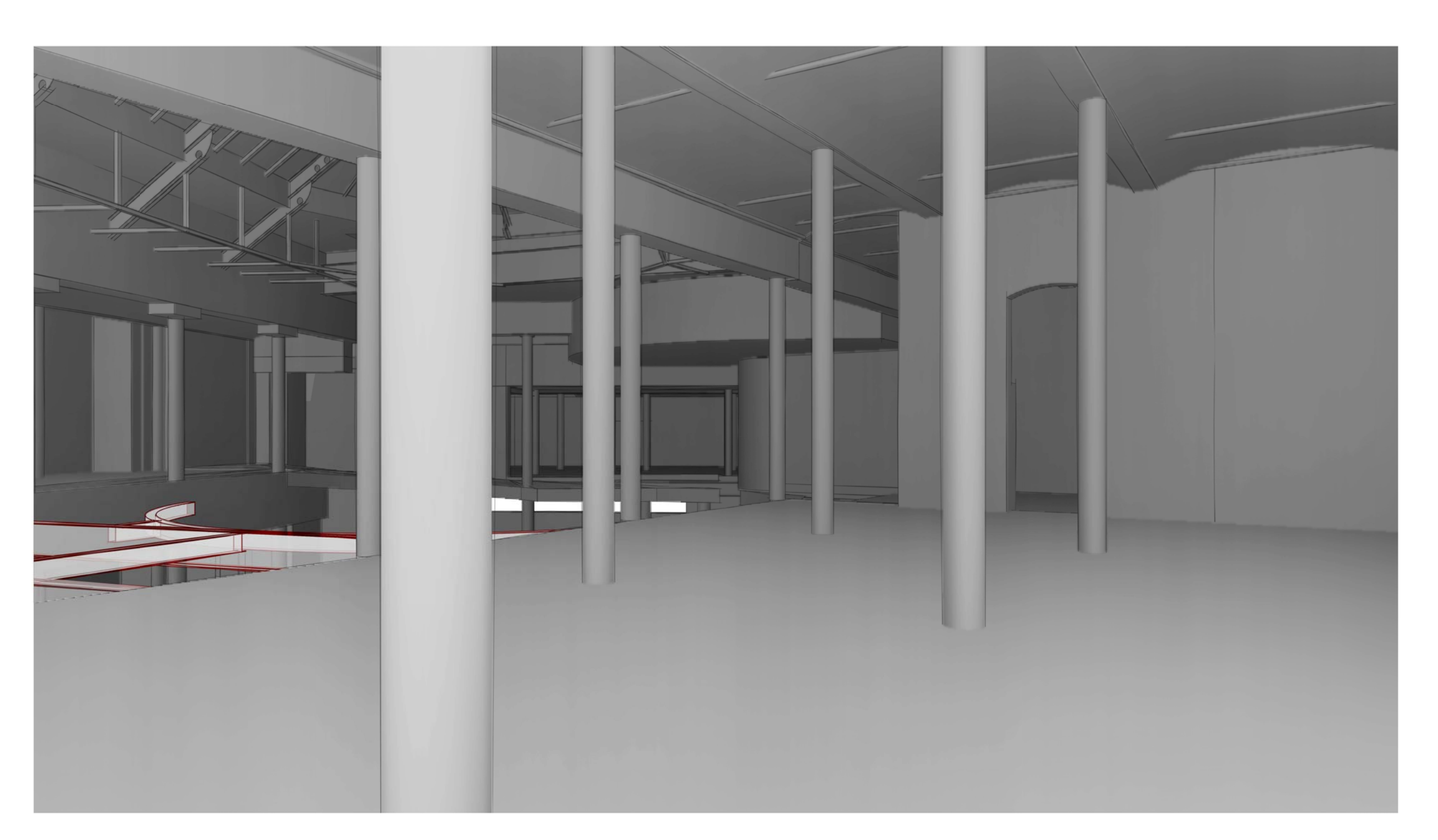
7 3D-PARTY WALL 04 - EXISTING